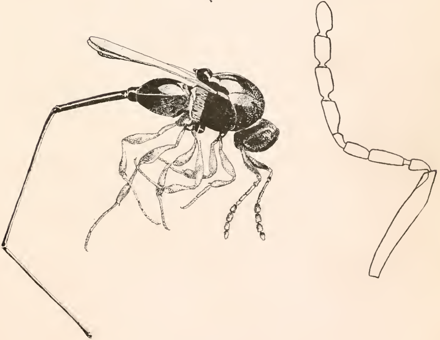
DOLICHOTRYPES HOPKINSI, NEW SPECIES.