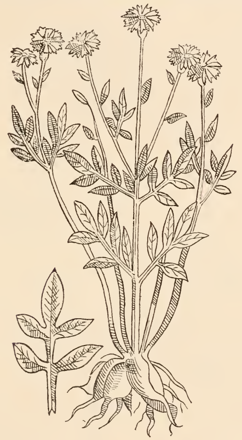
Fig. 1.—Duplex-flowered Dahlia, called Acocotli by the Aztecs. After Hernandez (1575).

of which, an aromatic Ligusticum with a hollow stem and fleshy roots resembling those of the genus Dahlia, was erroneously figured under the same heading as the two dahlias first described.