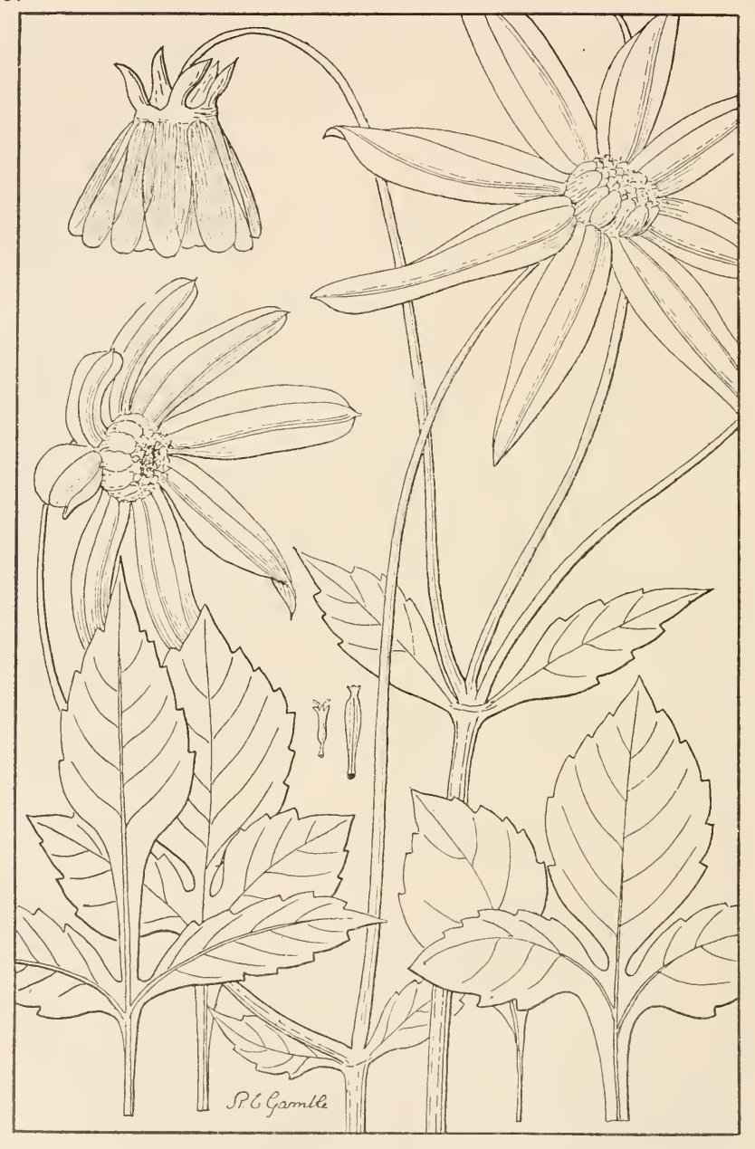
Fig. 3.—Dahlia popenovii, showing two flower heads, mature fruiting head, upper leaves of mature plant and a single leaf of a young seedling; also a ripe achenium. Drawn from type material and from a photograph of the flower by Mrs. R. E. Gamble, Bureau of Plant Industry. All natural size.