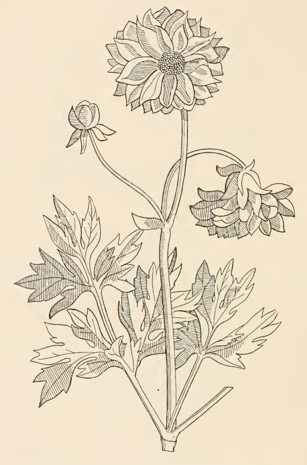
Fig. 2.—Peony-flowered Dahlia, called Acocoxochitl by the Aztecs. After Hernandez (1575).

now called "Duplex," with leaves like those of Dahlia variabilis , were poorly drawn (see fig. 1), but a third figure, reproduced in the accompanying illustration (fig. 2) was that of a Dahlia with