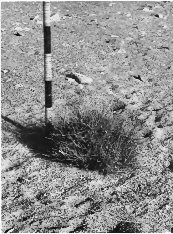
FIGURE 10.—Karkur Murr. Specimen of Crotalaria thebaica closely browsed by gazelles. Without interference the species grows to a height of 40 to 50 cms. Rod is divided into 10-cm units.

Sudan." All the brittle leaves had fallen from the specimen when he returned to camp.