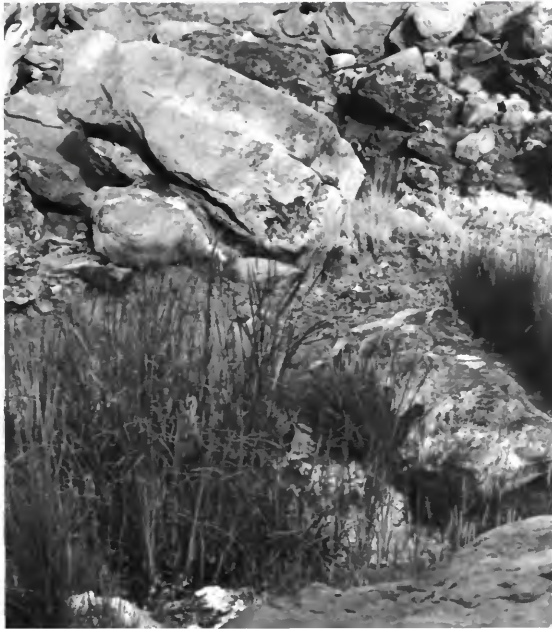
FIGURE 8.—Karkur Murr. Pool in eastern tributary. Note Typha australis and Imperata cylindrica .

Convolvulus cancerianus Abdallah and Sa'ad: Karkur Murr. Flowering.