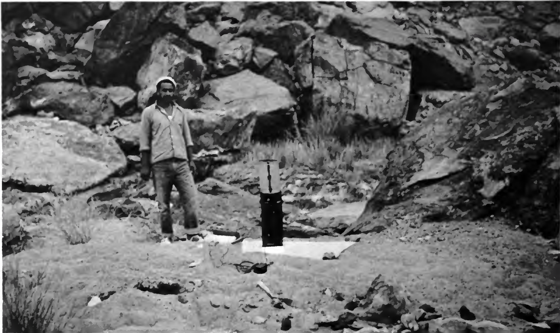
FIGURE 13.—Ultraviolet light trap near one of the rock pools, Ain Murr (Ain el Brins).