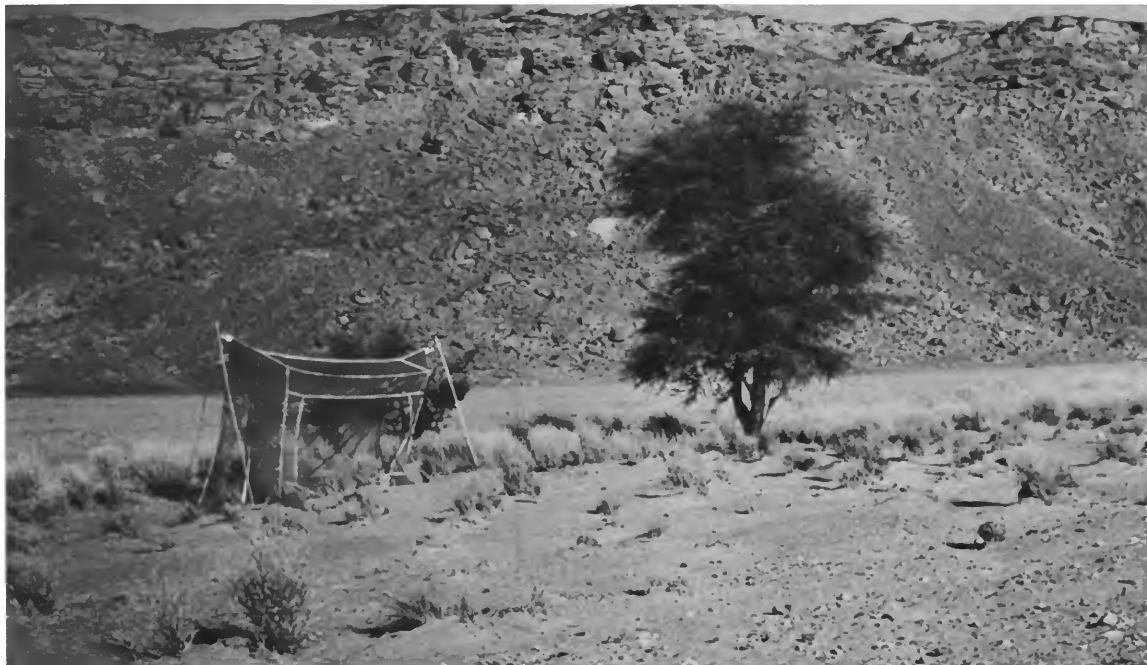
FIGURE 12.—Malaise trap suspended from two Acacia raddiana on the bedded channel below the broad alluvial fan.