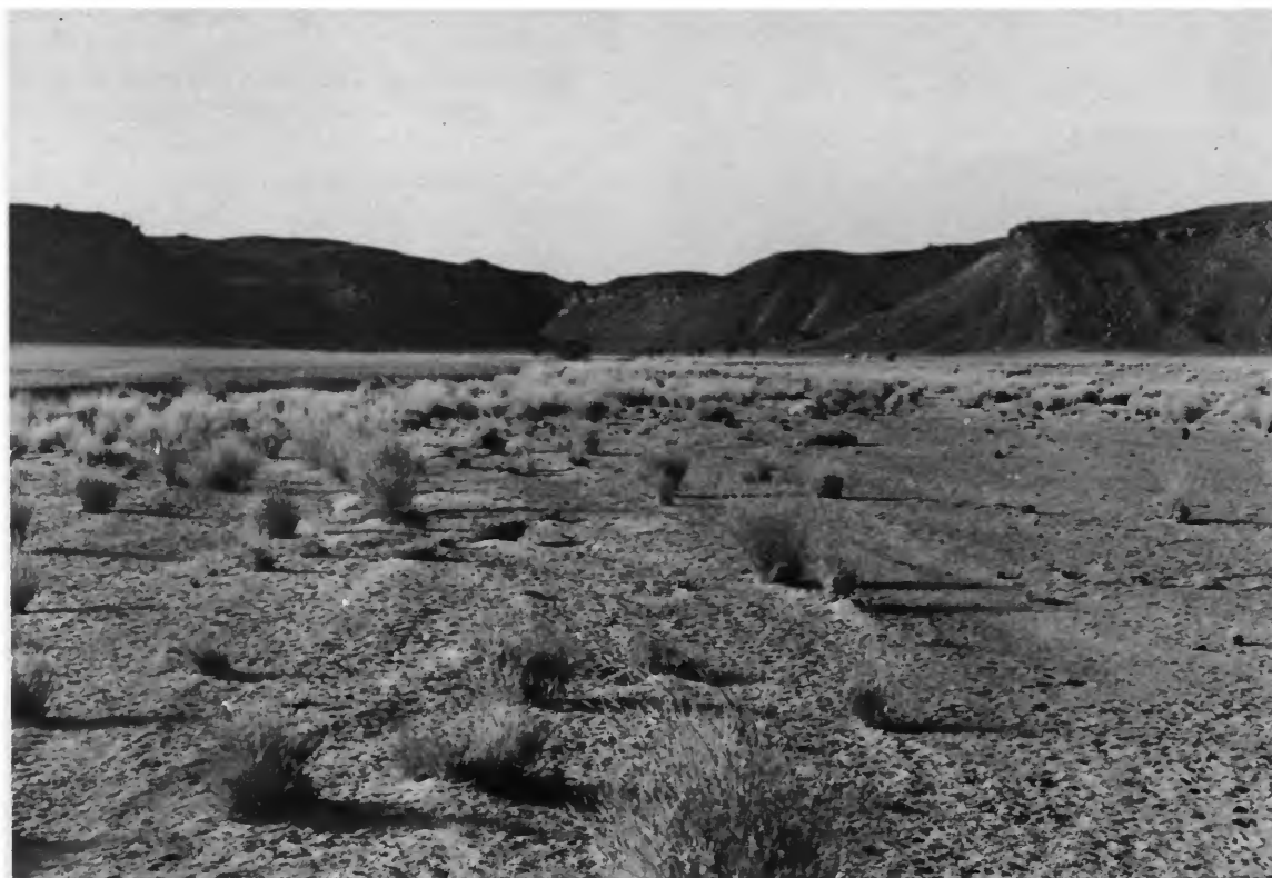
FIGURE 4.—Karkur Murr. Meandering streambed in alluvial plain. View north from same location as in Figure 3. Note mouth of canyon in center background.

coarse bunch grass, Panicum turgidum (Figures 2, 3). There are occasional patches of ground gourd ( Colocynthis vulgaris ) and a few prostrate Euphorbia granulata .