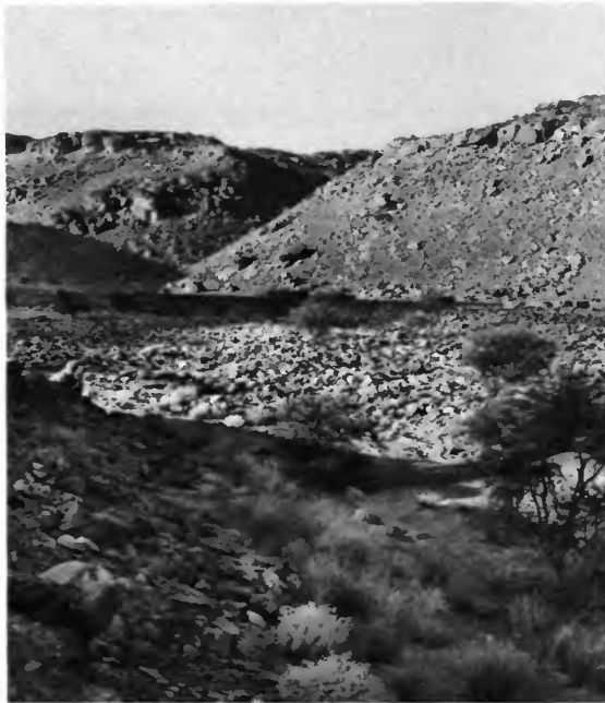
FIGURE 5.—Karkur Murr. Bedded channel in alluvial fan. View north-northeast. Stone huts are visible on the terrace in the background. Note the whitish Aerva persica .

Newbold (1928) the main vegetation of the valleys of 'Uweinat was Acacia , Tamarix , and Cornulaca .