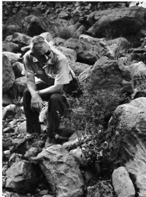
FIGURE 11.—Karkur Murr. Unbrowsed specimen of Forsskohlea tenacissima . Note clumps of Panicum turgidum in the background.

Happold (1966, 1967b) trapped G. (D.) c. venustus (Sundevall) in isolated volcanic and granite hills