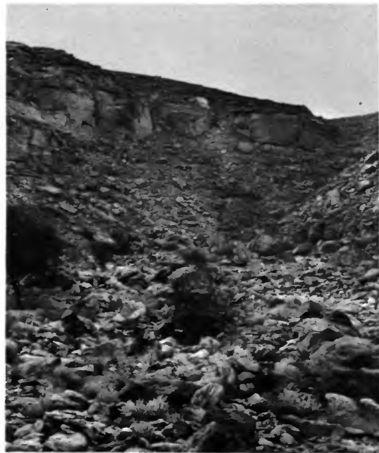
FIGURE 6.—Karkur Murr. Narrowing rocky canyon.

* Colocynthis vulgaris Schrader: Vernacular names, handal , colocynth or ground gourd. Karkur Murr. Fruits and flowers present. Common according to