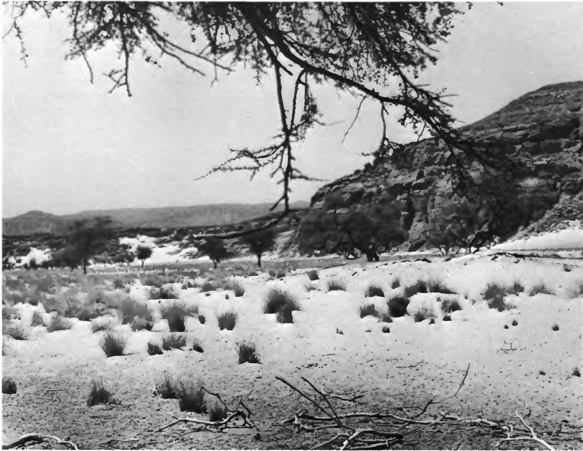
FIGURE 9.—Karkur Tahl. Note evidence of wind action—drifted sand and sculptured rocks. Trees are Acacia raddiana ; grass, Panicum turgidum . View southwest.

Indigofera sessiliflora De Candolle: Karkur Murr, rocky canyon. Flowering and fruiting.