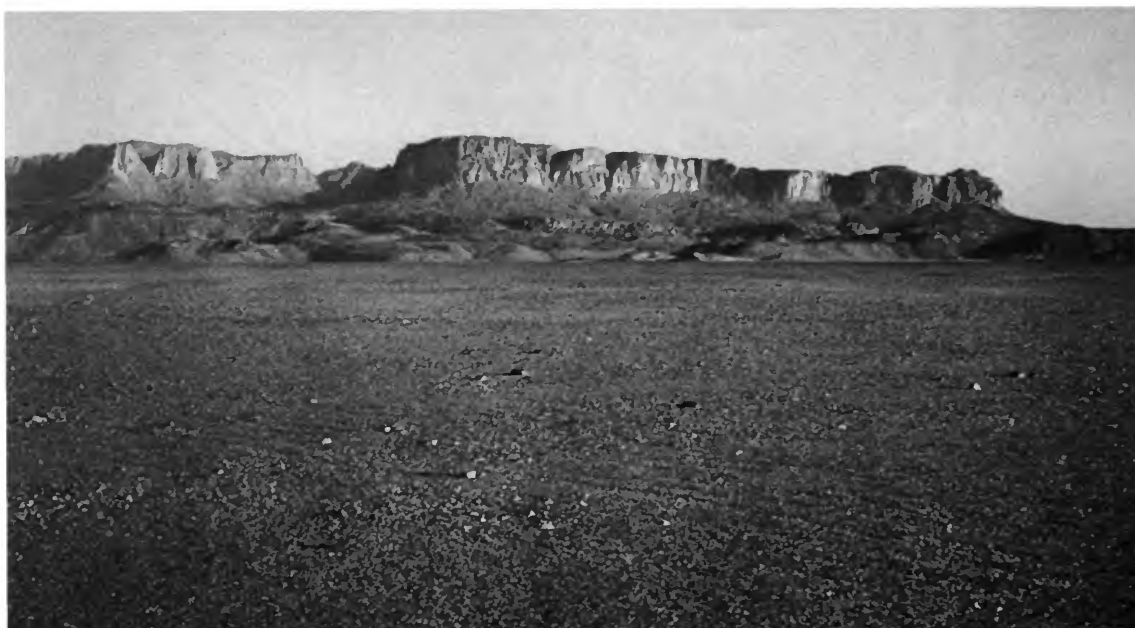
FIGURE 2.—Sandstone plateaus of Gebel 'Uweinât. View north-northwest from alluvial plain.

gery, Department of the Navy, Washington, D.C.; his efforts were supported in part by Office of Naval Research Contract Nonr 4414(00) NR 107-806 with Field Museum. The opinions and assertions contained herein are the private ones of the authors and are not to be construed as official or reflecting the views of the Department of the Navy or of the naval service at large.