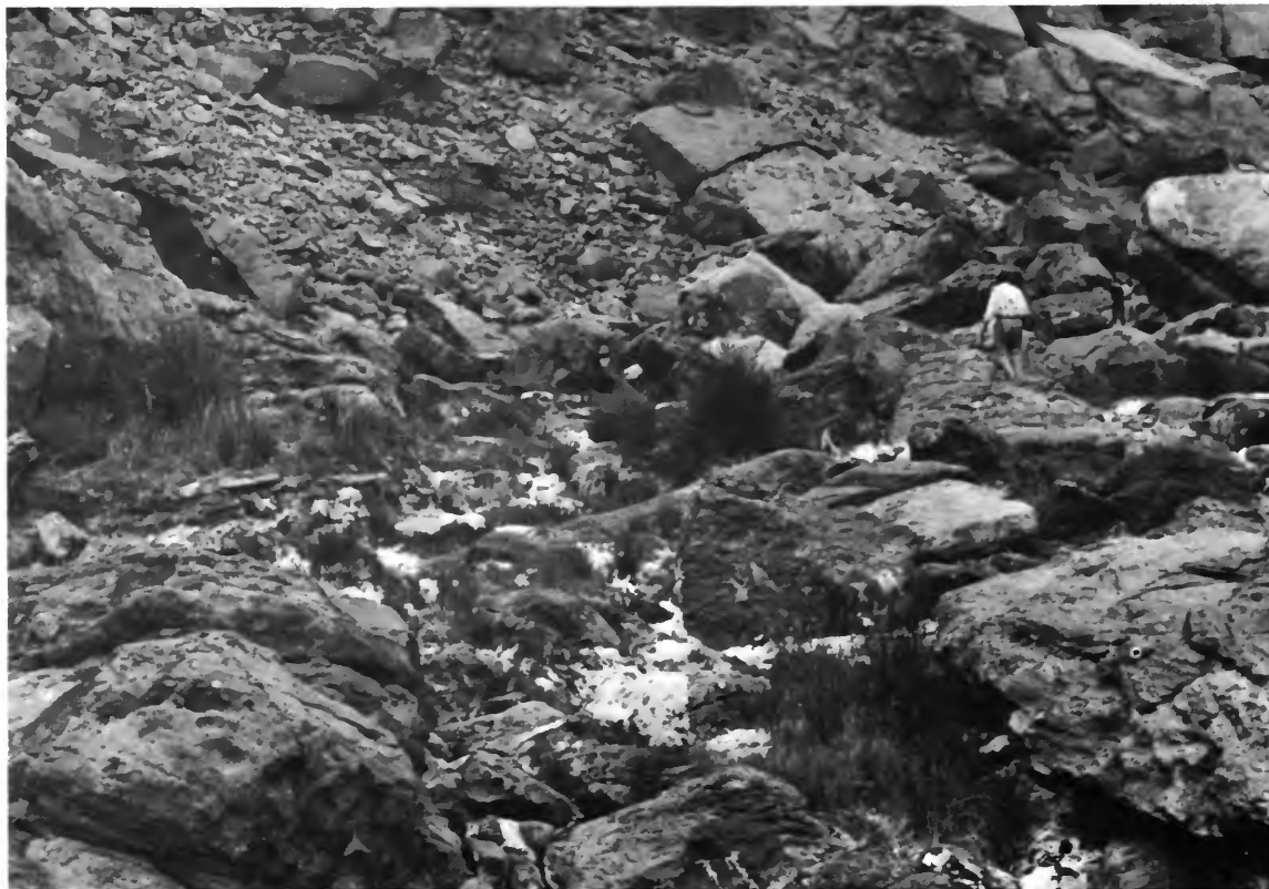
FIGURE 7.—Ain Murr (Ain el Brins). Rock pools in Karkur Murr. Note salty encrustations.

Hassanein Bey (1925), who wrote that the dried seeds were used to make abra , a staple food of the Goraan, after prolonged boiling to remove the bitterness. Common on the plain around the mountain (Shaw, 1934). Green gourds are eaten by Barbary sheep (Mason, 1936) and gazelle; the dry seeds and pulp are eaten by rodents (Osborn's observations) contrary to the opinion of P. A. Buxton (1923).