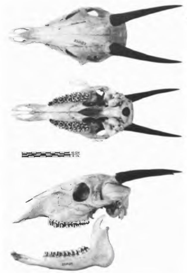
FIGURE 2. Dorsal, ventral, and lateral views of the cranium and lateral view of the lower jaw of a male yellow-backed duiker from Zaire (USNM 220127).