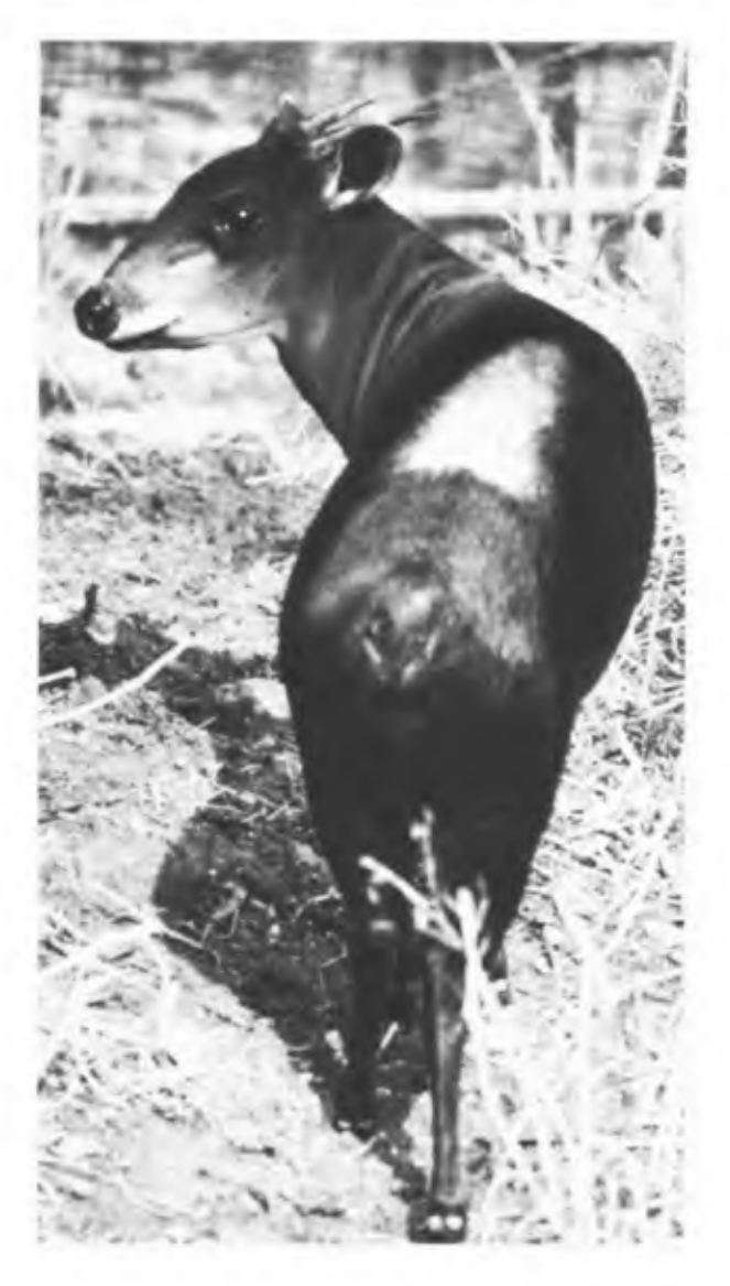
FIGURE 1. Photograph of an adult male yellow-backed duiker, captured in Sierra Leone, and now at the National Zoological Park, Washington, D.C.

GENERAL CHARACTERS. The largest of the Cephalophinae, the yellow-backed duiker has a convex back, higher at the