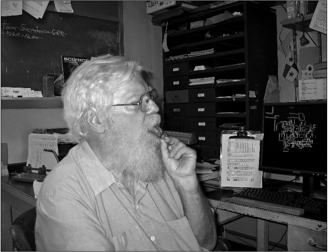
Fig. 2. Experiencing the sensory biology of a Túngara Frog ( Physalaemus pustulosus ).