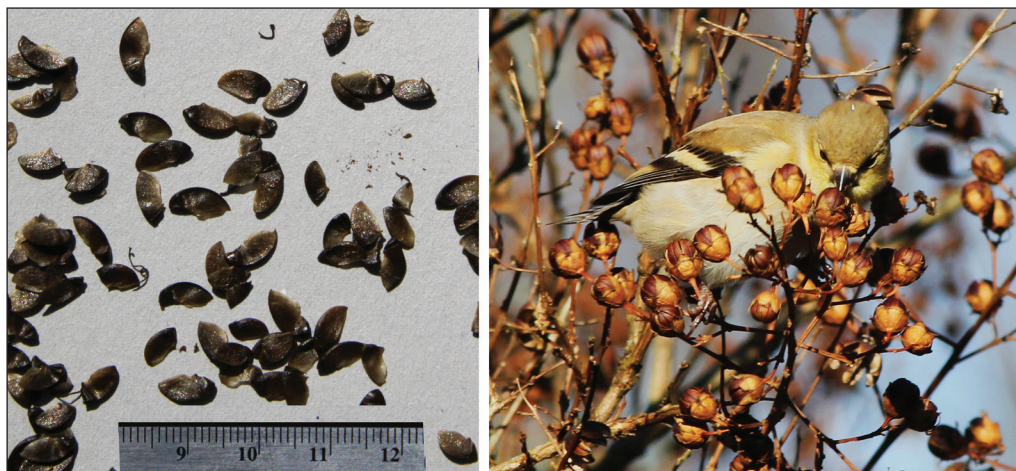
Figure 1. Left panel: winged seed of Lagerstroemia indica (Crapemyrtle). Right panel: Spinus tristis (American Goldfinch) feeding on Crapemyrtle seed.

To illustrate the seasonal pattern in Spinus tristis (American Goldfinch) feeding visitations, I pooled observations over 5 winters and conducted a distance-weighted least-square (DWLS) regression of daily-high counts, including days on which none were observed, on the elapsed time since 31 October. In this procedure,