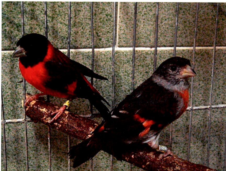
RED SISKIN PAIR CONFISCATED BY AUTHORITIES HOUSED AT PARQUE ZOOLOGICO Y BOTANICO BARARIDA