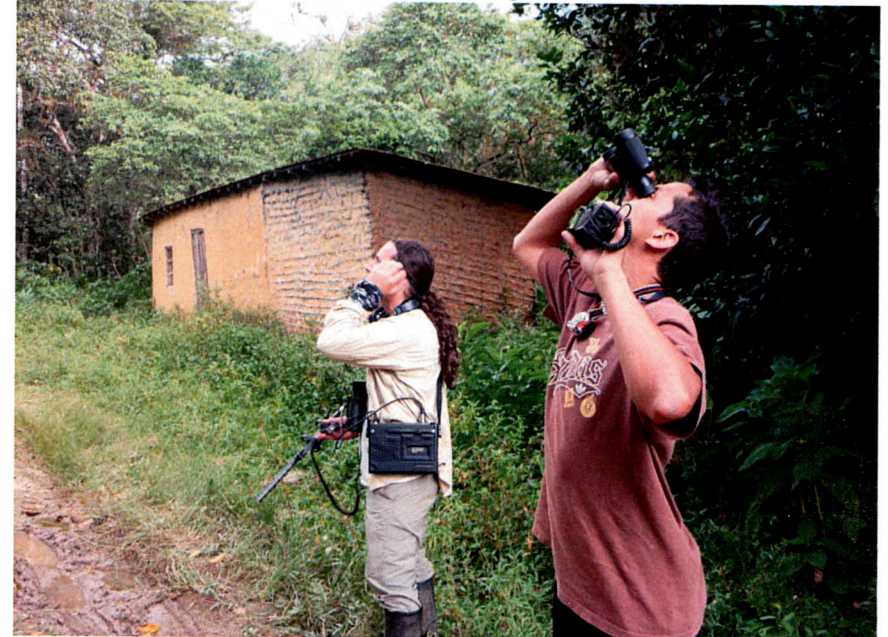
FIELD RESEARCHERS SEARCHING FOR RED SISKINS AND RECORDING VOCALIZATION

A promising site for the breeding program is Parque Zoológico y Botánico Bararida, located in the city of Barquisimeto in Lara state, Venezuela. The Red Siskin is the state bird in Lara and Bararida has a government mandate to conserve the species. Bararida also has a history of success in ex situ breeding and a vibrant conservation education program built around the Red Siskin. Currently, they have two pairs of red siskins that were confiscated from trappers; however, existing facilities are inadequate to support a full scale ex-situ conservation program.