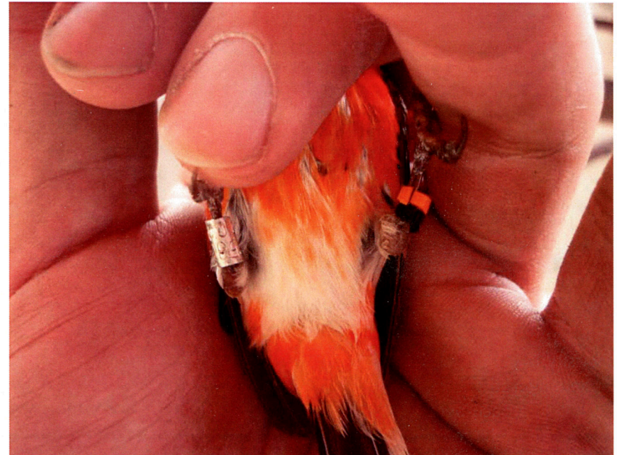
RED SISKIN MARKED WITH LEG BANDS FOR FUTURE IDENTIFICATION

This commitment to education also extends to project partners in Venezuela and the United States. Bararida has an innovative education campaign with diverse elements including visits to schools, and on-site programs that aim to create "green citizens" who are knowledgeable advocates on conservation issues. Smithsonian partners are working to produce a television program about the Red Siskin Recovery Project, and web-based education resources are planned for the future. Project members have also been providing field and laboratory research training and other significant professional development opportunities to promising young conservationists from South America.