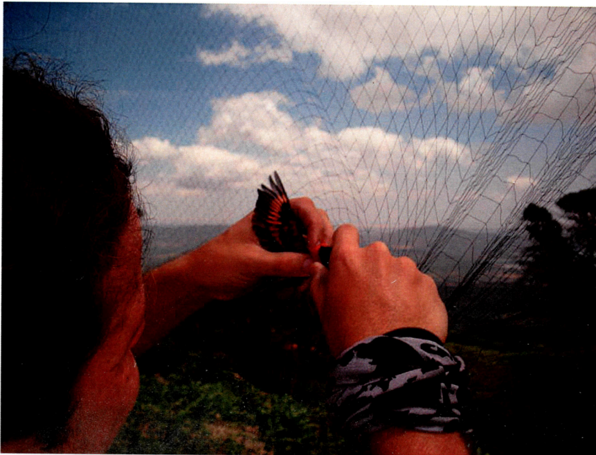
CAPTURED RED SISKIN BEING RELEASED FROM MIST NET

In addition to making progress on developing a captive breeding program, the Red Siskin Recovery Project has also been exploring reintroduction strategies. One possibility is based on the Smithsonian Migratory Bird Center's "Bird Friendly" coffee certification program. This program marries economic development with conservation by providing market incentives for farmers to adopt agricultural practices that improve habitat and support biodiversity.