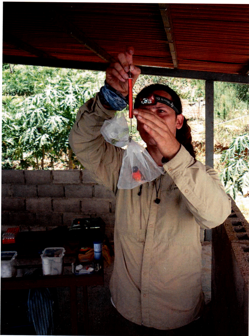
COLLECTING MORPHOMETRIC DATA

Finally, this summer the Recovery Project will host multiple meetings of scientists, passerine breeders, architects, and other experts. Meeting objectives are to develop ex situ breeding strategies, start designing the breeding and education center, and draft a comprehensive conservation management plan. This plan will help support fundraising to sustain progress and guide the conservation effort through recovery.