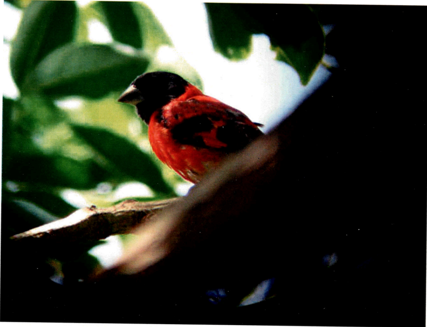
WILD RED SISKIN IN VENEZUELA

Results show substantial differentiation between Red Siskins in Guyana and Venezuela, which suggests they should be managed as distinct conservation units that should not be used to supplement each other. Current research is focused on refining estimates of genetic diversity and developing genomic markers (ultra-conserved elements, microsatellites, single nucleotide polymorphisms) for management of an ex situ captive breeding program through the use of next-generation DNA sequencing (NGS) technologies.