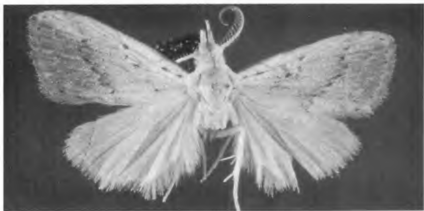
Fig. 1. Rhynchopalpus brunellus , wing pattern, Hawaii I (Bishop Museum).