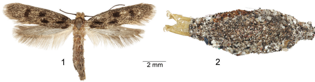
FIGS. 1–2. Phereoeca praecox . 1. (♀), Clairmont, San Diego County, California. Wingspan 12.8 mm. 2. Larval case of adult in Figure 1. Length of case 10 mm.