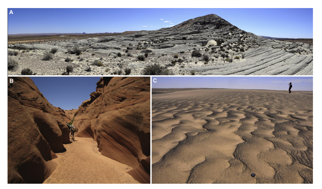
Fig. 2. Field trip sites. (A) Entrada Sandstone, exposing a complex oblique dune with superimposed secondary transverse dunes, (B) Navajo Sandstone, with crossbedding revealed in the steep walls of a wash, and (C) Grand Falls Dune Field, showing low barchans and coarse-grained ripples composed of finer, bright sand and coarser, dark granules.

The International Planetary Dunes workshop was the third in a series of meetings, listed in Table 1 (Titus et al., 2008, 2010, 2012; Fenton et al., 2010). The goal of all such workshops has been to foster collaboration between terrestrial and planetary aeolian researchers, including those who perform studies with models, in laboratories, in the field, and with remote sensing data. Recent work attests to the vigor of research in this rapidly expanding field (Zimbelman, in review/this issue?). Timothy N. Titus (USGS, Flagstaff) convened this meeting with a scientific organizing committee including Mary Bourke (Planetary Science Institute), Lori Fenton (Carl Sagan Center at the SETI Institute), Rosalyn Hayward (USGS, Flagstaff), Briony Horgan (Arizona State University), Nick Lancaster (Desert Research Institute), and David Rubin (USGS, Santa Cruz). As with the two preceding workshops, this one was designed to have an intimate atmosphere to encourage discussion; a total of 48 participants registered. Each speaker was given 30 min to talk and strongly encouraged to leave half of that time open for questions. Extended abstracts follow the standard two page format of the Lunar and Planetary Institute, and may be found at the meeting website: http://www.lpi.usra.edu/meetings/dunes2012/.