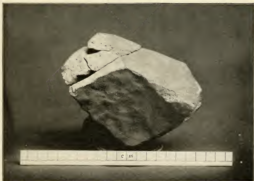
THE FELIX METEORITE.