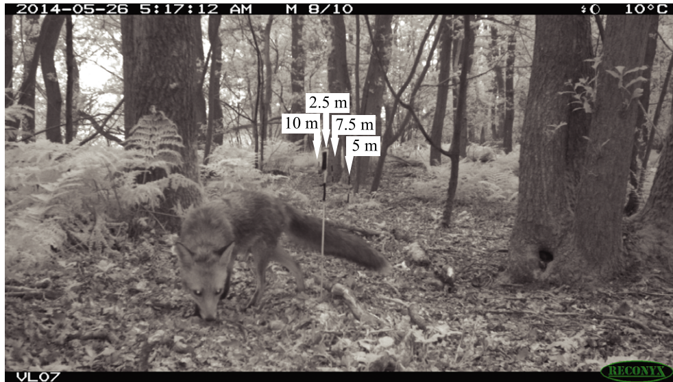
Figure 1. Camera trap photograph with a transect of markers at 2.5 m, 5 m, 7.5 m and 10 m, and a passing red fox ( Vulpes vulpes ).

individuals. Furthermore, we noted, for each individual animal, if it crossed the midline of the FOV, and if so, through which interval they passed. If the animals passed just behind the last marker, we noted it as passing in an interval of 2.5 m behind the last marker. There were no animals that triggered the camera and passed the line >2.5 m past the last marker.