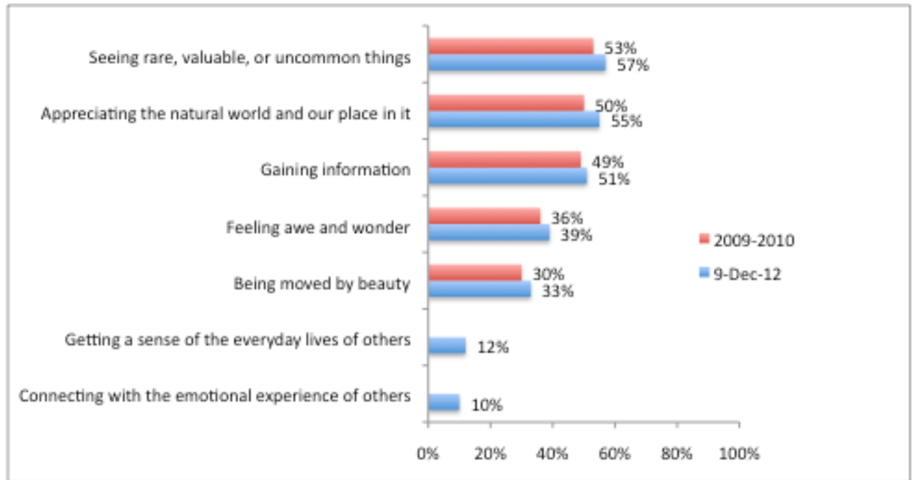
Table 2 Especially Satisfying Experiences

The distribution of demographic characteristics was also very similar to the January-February, 2010, sample, with one notable exception: women outnumbered men in the December 2012 sample (53% vs. 47%), while men outnumbered women in the 2010 sample (54% vs. 46%). (See Appendix B.)