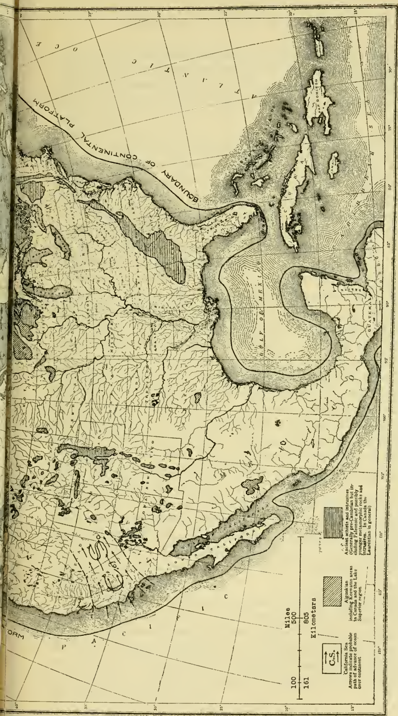
MAP OF NORTH AMERICA SHOWING DISTRIBUTION OF PRE-CAMBRIAN ROCKS (AFTER VAN HISE AND LEITH, 1909.)