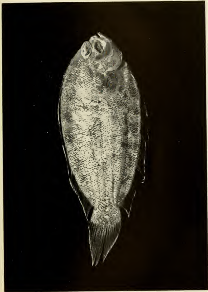
POECILOPSETTA ALBOMARGINATA Holotype, U.S.N.M. 93303. Natural size.