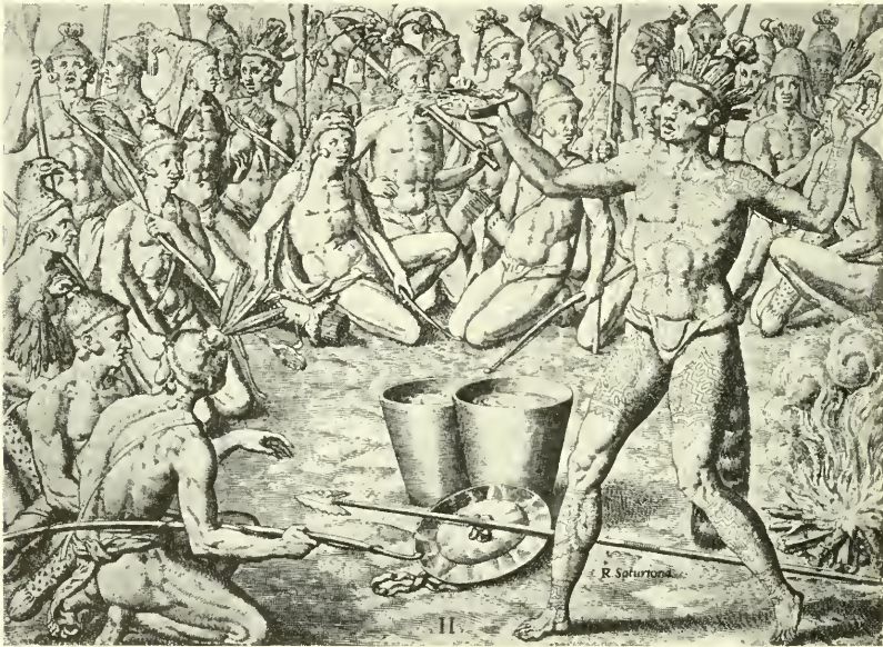
FIG. I.—Ceremonies performed by Saturioua before going on an expedition against the enemy. From De Bry, 1591.