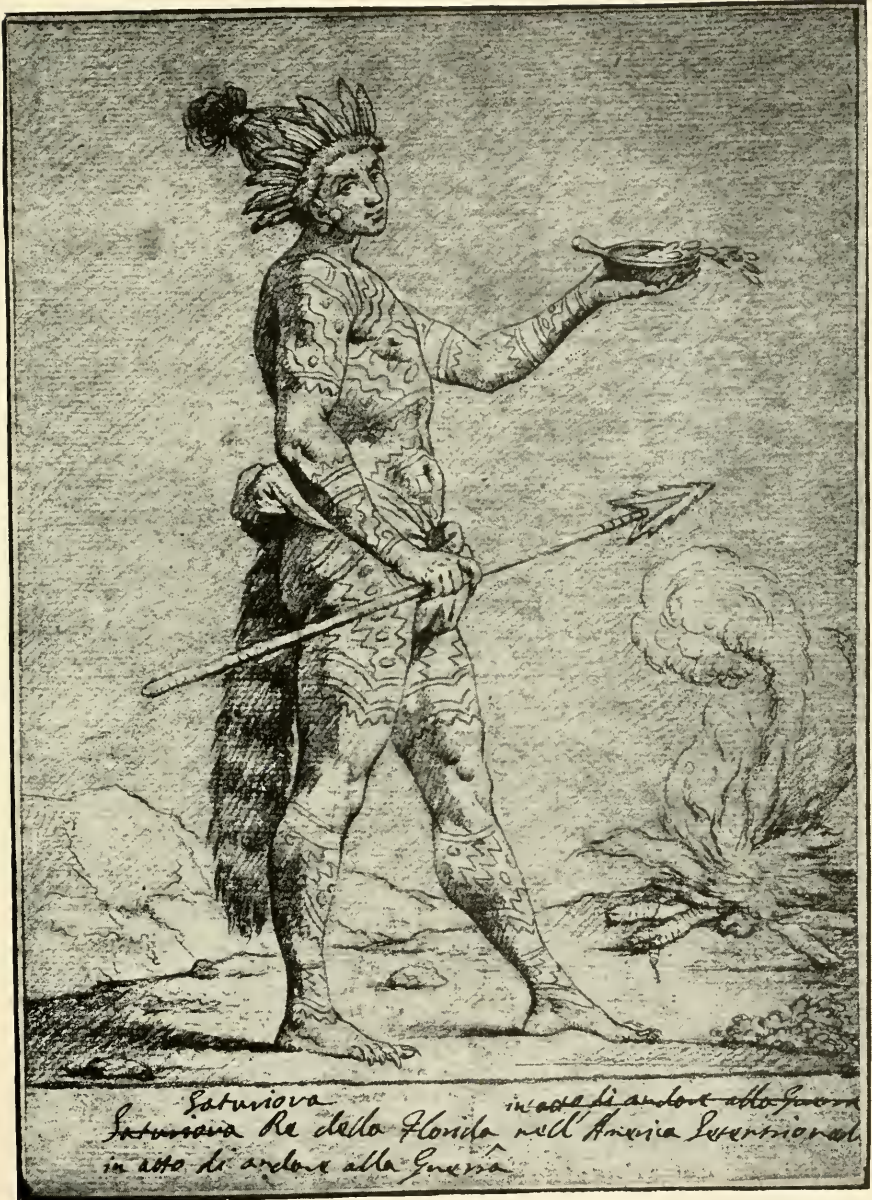
Size 10 by 7 inches