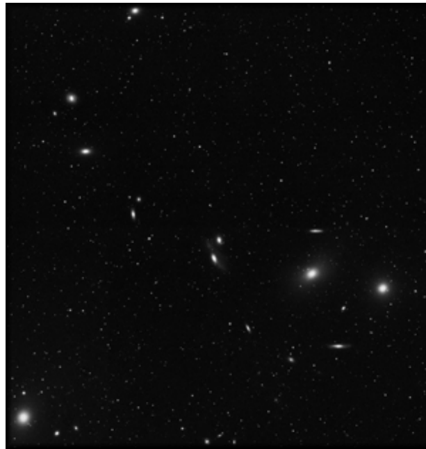
An optical image of the galaxy Messier 89 (the fuzzy round blob at the lower left) together with other associated galaxies in the Virgo cluster of galaxies. SAO astronomers have imaged and studied hot, X-ray emitting gas in M89 as it is stripped away as a result of the galaxy's supersonic motion through the intergalactic cluster gas.