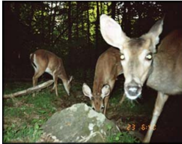
Camera-traps used by citizen scientists capture a wide range of wildlife, ranging from opossum and white-tailed deer to raccoon in residential neighborhoods of High Knob, Front Royal, VA.