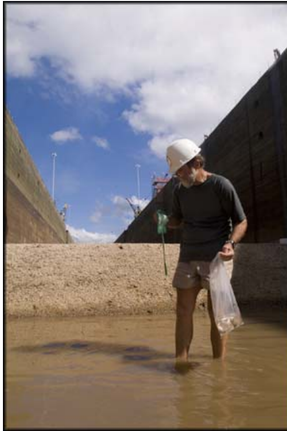
Smithsonian researchers have found evidence of fish passing through an "impassable" barrier.