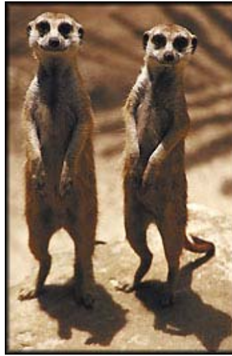
Dominant female meerkats stress out subordinate females.