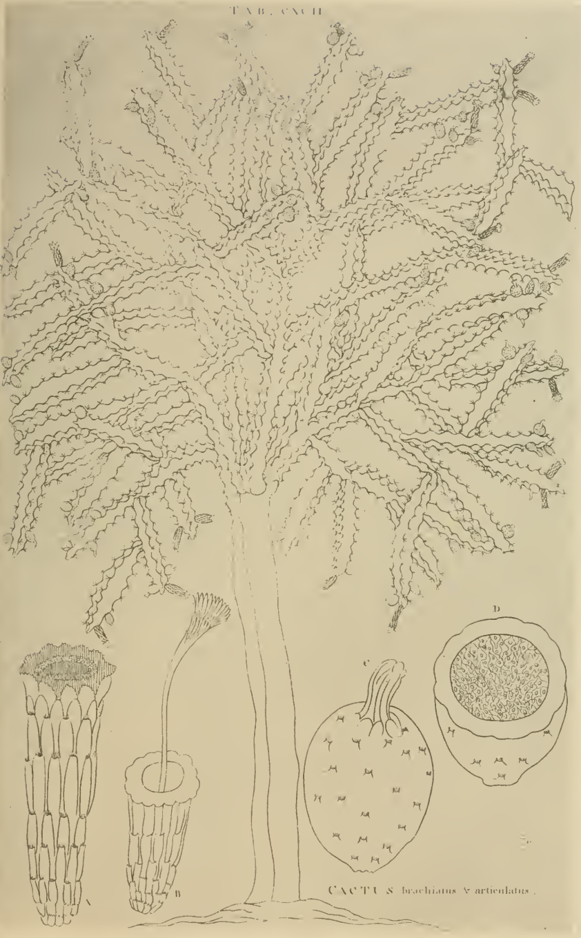
NEOABBOTTIA PANICULATA (LAM.) BRITT. AND ROSE