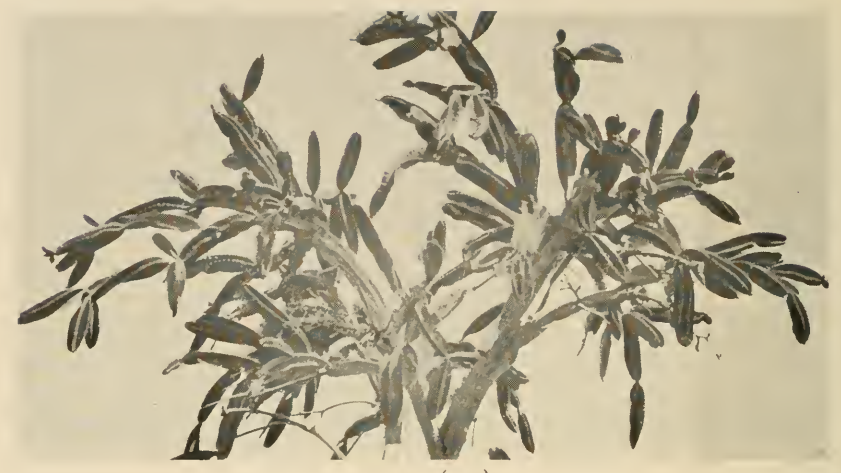
A. NEOABBOTTIA PANICULATA (LAM.) BRITT. AND ROSE