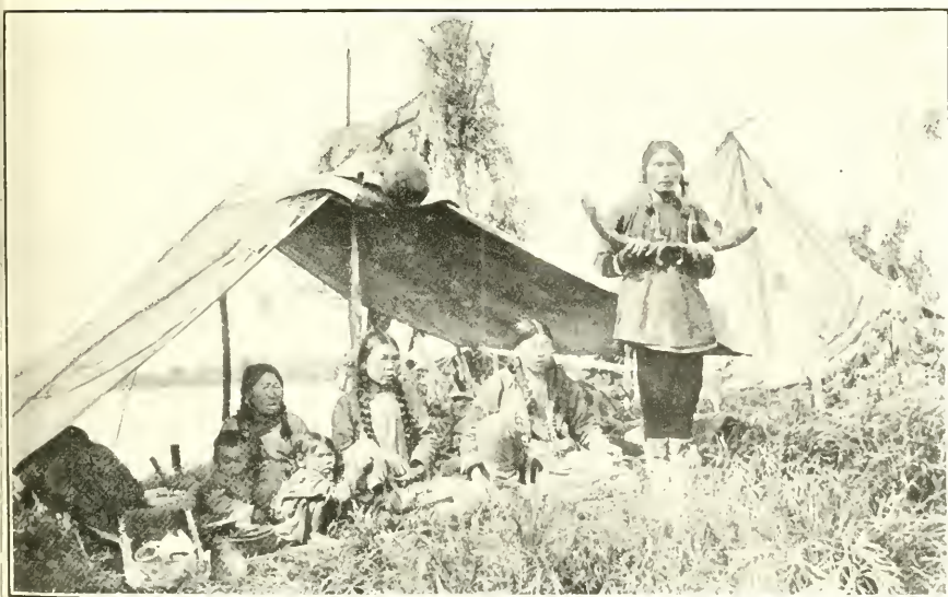
OROCZI, ON THE RIVER IMAN, EASTERN SIBERIA