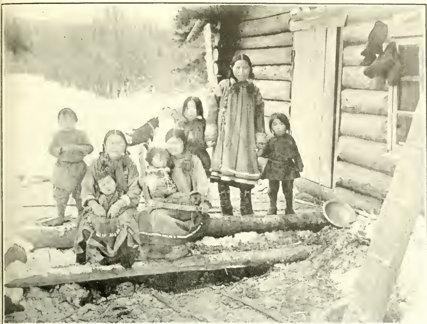
OROCZI, ON THE STREAM KONI, EASTERN SIBERIA