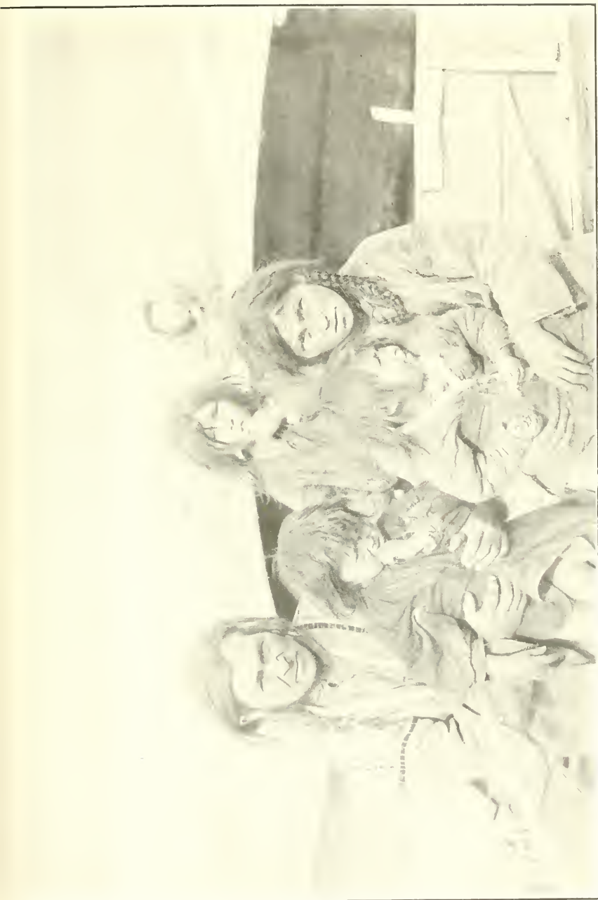
A FAMILY OF YENISEI OSTIAKS