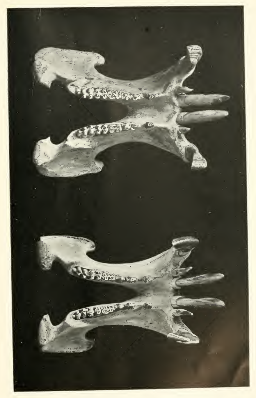
HIPPOPOTAMUS AMPHIBIUS. ZAMBEZI RIVER HIPPOPOTAMUS CONSTRICTUS. TYPE