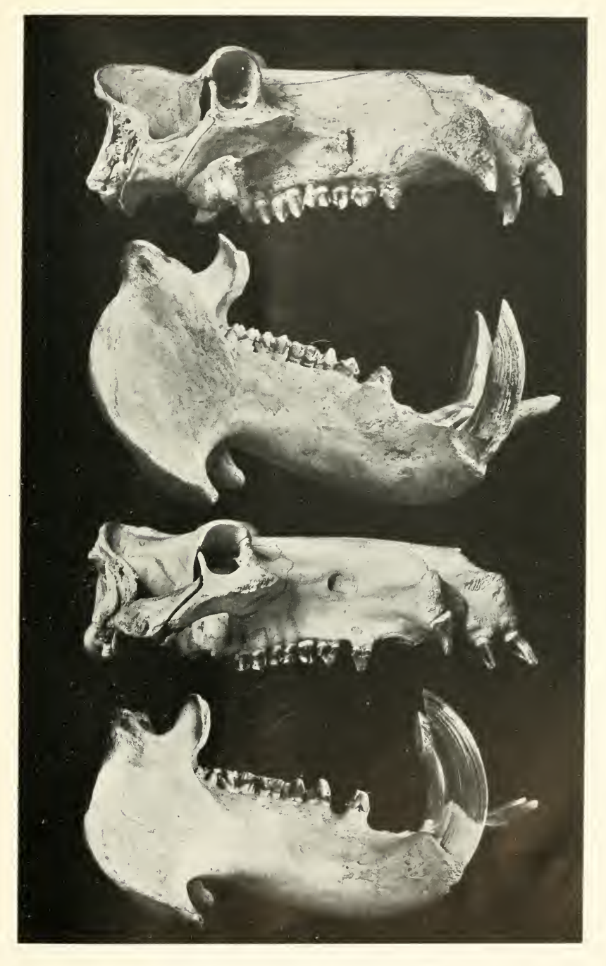
HIPPOPOTAMUS AMPHIBIUS. ZAMBEZI RIVER HIPPOPOTAMUS CONSTRICTUS. TYPE