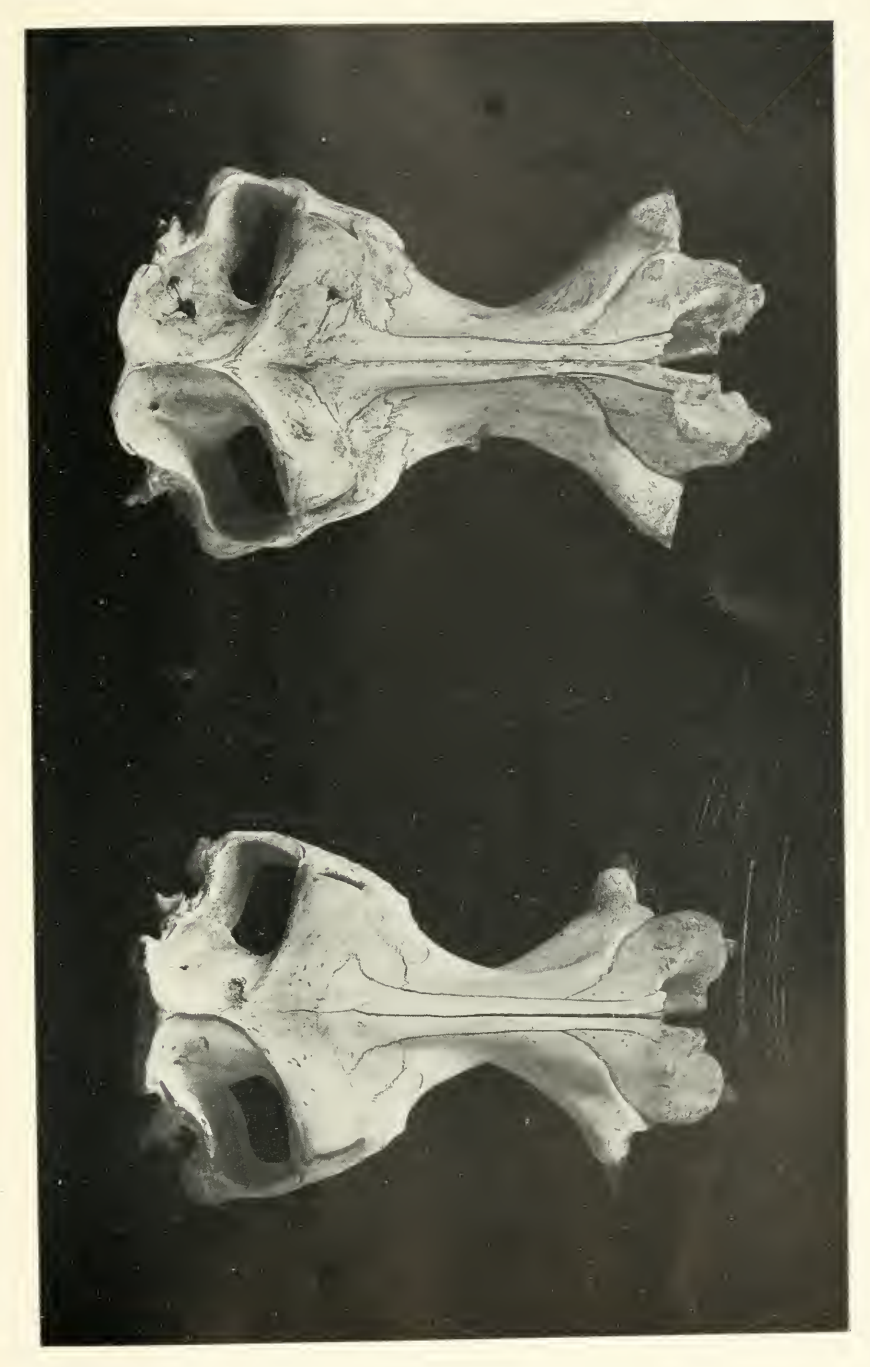
HIPPOPOTAMUS AMPHIBIUS. ZAMBEZI RIVER HIPPOPOTAMUS CONSTRICTUS. TYPE