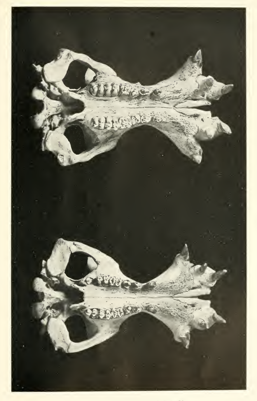
HIPPOPOTAMUS AMPHIBIUS. ZAMBEZI RIVER HIPPOPOTAMUS CONSTRICTUS. TYPE