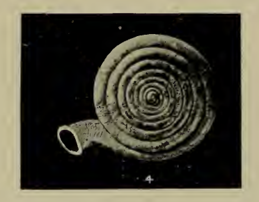
CENTRAL MEXICAN LAND SHELLS