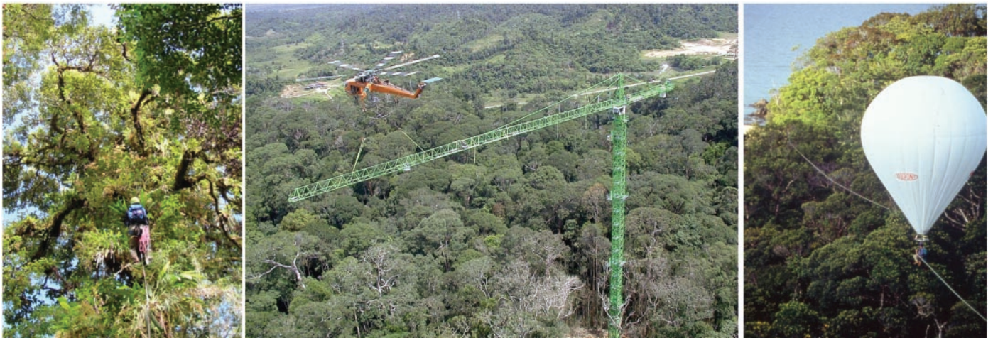
Fig. 1. Canopy-access techniques. (Left) Single-rope technique for sampling suspended soils. (Middle) Construction of Sarawak canopy crane. (Right) Canopy bubble—helium-filled balloon for canopy access.

Detritus-based food webs are ubiquitous: Within the canopy, trees grow roots from branches and inside trunks to access them (35). Dead and moribund branches have a rich associated fauna of saproxylic insects (36) (saprophages plus fungivores) and 40% or more of the canopy populations of Coleoptera (37). Perched litter, principally associated with the “baskets” of Asplenium ferns, are a prominent feature of most Old-World canopies (2), as is suspended litter and soil in temperate forests (38). These not only represent an additional, substantial biomass of detritus, but also have a rich fauna with many endemic species of groups such as Collembola (2) and Acari (3).