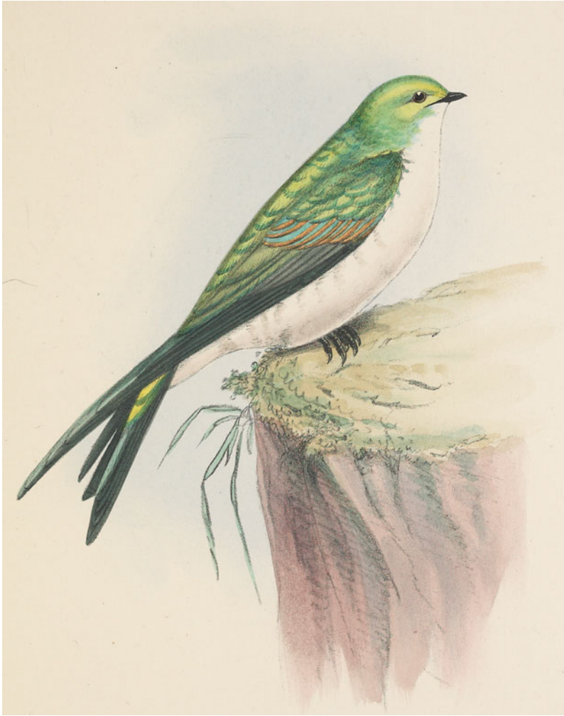
Figure 1. Lithograph of Golden Swallow from Plate 12 of Illustrations of the Birds of Jamaica (Gosse 1849).

road safety, cultural sensitivity, good sight lines, and distance from other census sites (minimum distance > 0.7 km). Census sites were located along paved roads, unimproved roads accessible with four-wheel drive vehicles, and along foot trails. Surveyed habitat included wet limestone forest, dry limestone forest, lower montane rain forest, mangrove forest, residential gardens and orchards, shaded coffee plantations, pasturelands with scattered old growth trees, church yards, ruinate woodland, and patchworks of secondary woodland, sugar cane, banana and coconut plantations, bamboo, agricultural scrub, and pasture. No censuses were conducted in plantation monocultures of sugarcane or in arid scrub lacking trees of sufficient stature ( \geq 10 m in height) along the southern coast. Ad hoc searches were conducted during several thousand kilometres of driving between census sites and on long distance trips though habitat that was outwardly unsuitable for swallows on the southern coastal plain.