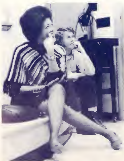
Dr. Johnnetta Betsch Cole, Professor of Anthropology, Afro-American Studies and Women’s Studies at the University of MA, Amherst.