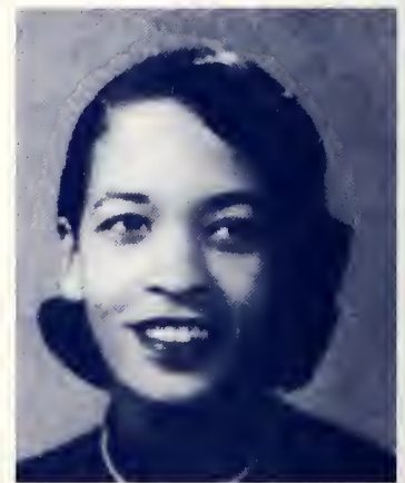
Senior yearbook photo, Oberlin College, 1957.

The adults in my family were outspoken opponents of segregation and activists in the struggle against racism. From an early age, I was exposed to calls for racial equality; and as I moved into my teens, I became an active participant in marches and demonstrations against segregation. The fundamental basis on which my family, my community members, and I called for an end to the ideology of segregation was rooted in the belief that the “Negro race” was just as good and smart as the “White race.” However, I do not recall hearing anyone question the very concept of different races. Indeed, the idea that there are different “races” was so pervasive that most Black Americans believe this to be a reality. It was many years later in an anthropology class at Oberlin College that I was exposed