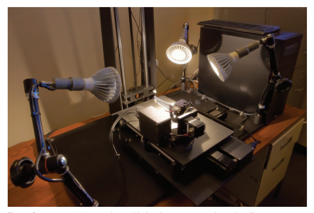
Figure 2. Two ROBOT(E) remotely operable digital imaging systems designed to allow taxonomists to examine, manipulate, and digitally photograph type specimens through a Web connection. Three such instruments are being deployed to major insect collections in Washington, London, and Paris. A proto-type instrument remains with the IISE for testing and development purposes.

Networking three leading insect collections in Washington, DC (Smithsonian Institution, National Museum of Natural History, Department of Entomology), London (Natural History Museum, Department of Entomology), and Paris (Museum National d'Histoire Naturelle, Laboratoire d'Entomologie) we set out to demonstrate that telemicroscopy could be used to implement our "K" strategy. With just these three nodes in a network of remotely operable microscopes in a network scheduled to go "live" in December, 2012 we will open potential access to a large fraction of insect type