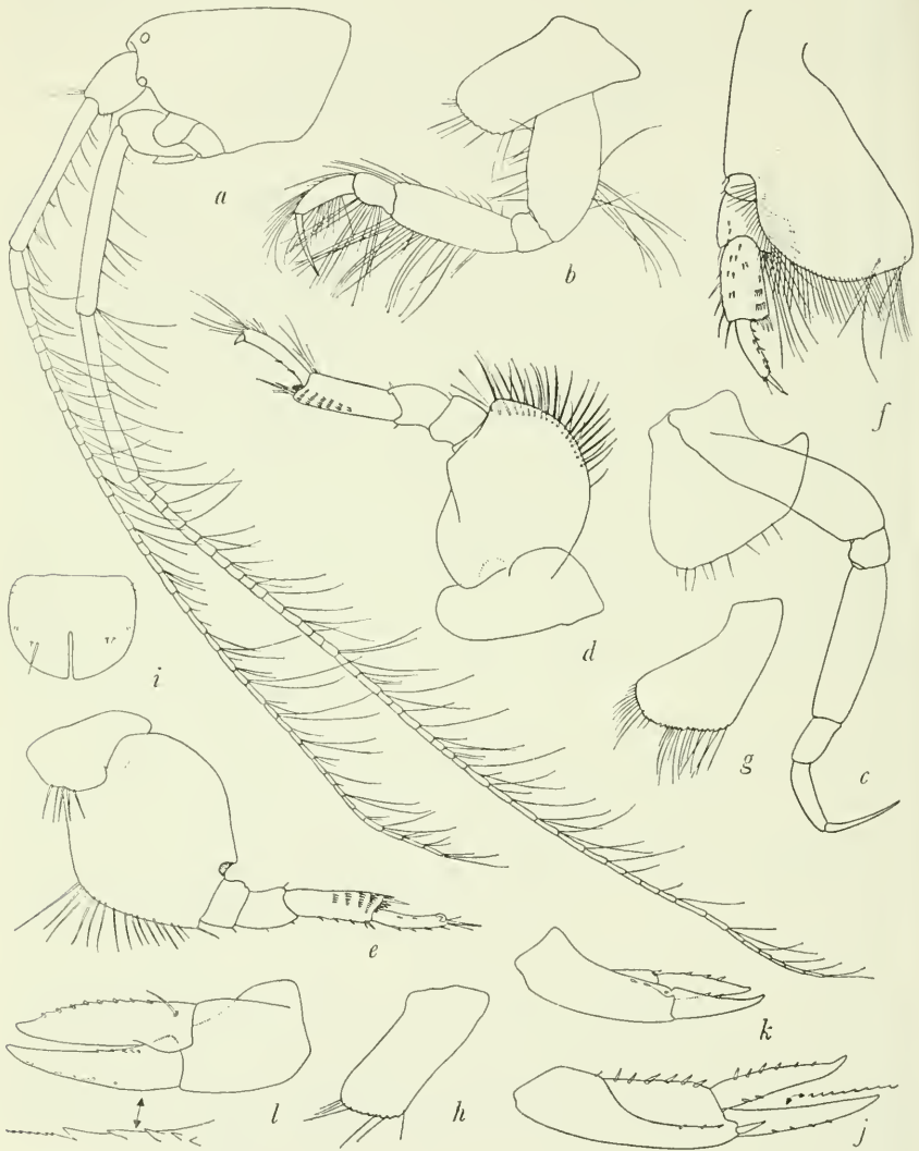
FIGURE 3.— Byblis ampelisciformis , new species, male, holotype, 12.0 mm, Albatross 3708: a, head; b-f, pereopods 1-5; g, h, coxae 1, 2; i, telson; j-l, uropods 1-3, latter enlarged.

B. japonicus Dahl, and B. erythrops Sars in the following characteristics: Corneal lenses present, lower pair visible laterally, pereopod 2 similar to pereopod 1, telson cleft a third or more, antenna 1 subequal