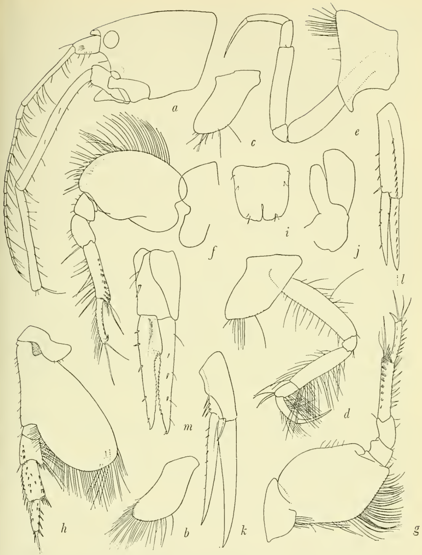
FIGURE 2.— Byblis albatrossae , new species, female, holotype, 15.0 mm, Albatross 3738: a, head; b, c, coxae 1, 2; d-h, pereopods 1-5; i, telson; j, outline of maxilla 2, minus setae; k-m, uropods 1-3, latter enlarged.