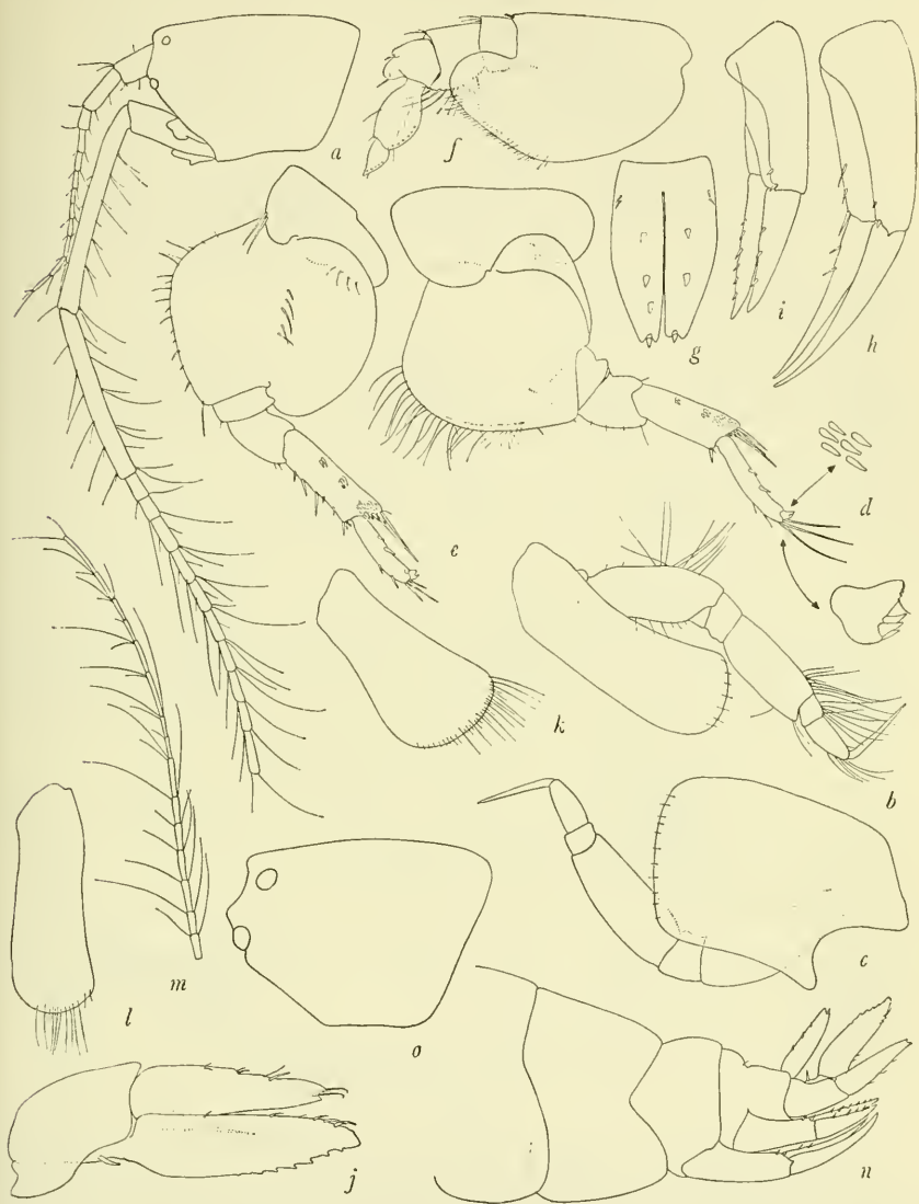
FIGURE 1.— Ampelisca schellenbergi Shoemaker, Albatross 3809, female, 7.6 mm: a, head; b-f, pereopods 1-5; g, telson; h-j, uropods 1-3; k, l, coxae 1, 2; m, continuation of antenna 2 from fig. a; n, pleonites 2-6, left lateral (5-6 coalesced). Ampelisca eschrichtii Krøyer, female, 20.0 mm, Albatross 3195: o, head.

stouter than in female, with stouter flagellar articles; base of flagellum of antenna 1 slightly more setose, but young males lacking setal