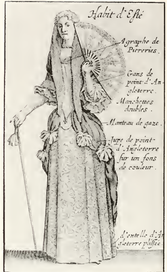
Figure 22.—SUMMER DRESS of a lady with a pleated lace ( Point d'Angleterre) petticoat. From the Extraordinaire of the Mercur Galant, June 1678.