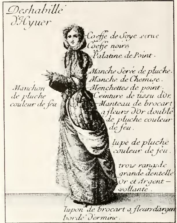
Figure 19.—LADY IN INFORMAL winter attire walks to her coach wearing a flowered gold-brocaded gown which has been caught back to show her embroidered petticoat bordered with ermine. She wears a black coif so that her hair will not be disarranged. Issued with the Mercuré Galant , 1678.

since the octavo publications ("Chez Claude Barbin au Palais") were pirated almost immediately, and impressions—all that I have seen are duodecimos—appeared in Paris and Amsterdam ("Suivant la Copie imprimée à Paris"). A single number of an English translation, the Mercury Gallant , is in the British Museum.