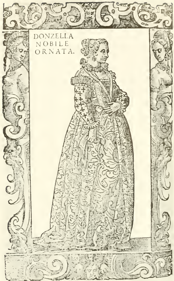
Figure 9.—DRESS OF A NOBLEWOMAN of Mantua. From Vecellio, De gli habiti antichi e moderni , 1590.

century, 19 but was not adopted in France, Italy, and England until the second half of the 16th century.