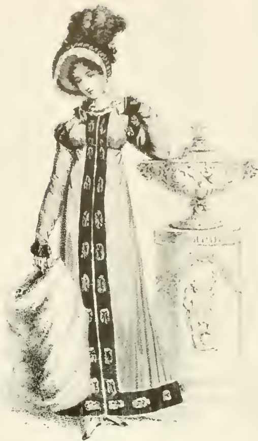
Figure 33.—WALKING DRESS OF GRAY MERINO. Plate 38, Ackermann's Repository of the Arts , 1819.

is fully documented with tailors' patterns and illustrations. As all details were prescribed by court regulations and very little scope was left for the impulses and personal choice of the wearers, the dress may be regarded to a great extent as a uniform rather than a fashion. Modifications did take place, however, and the style continued into the 19th century. As late as 1827, a pamphlet was published in Copenhagen on the same subject. 44