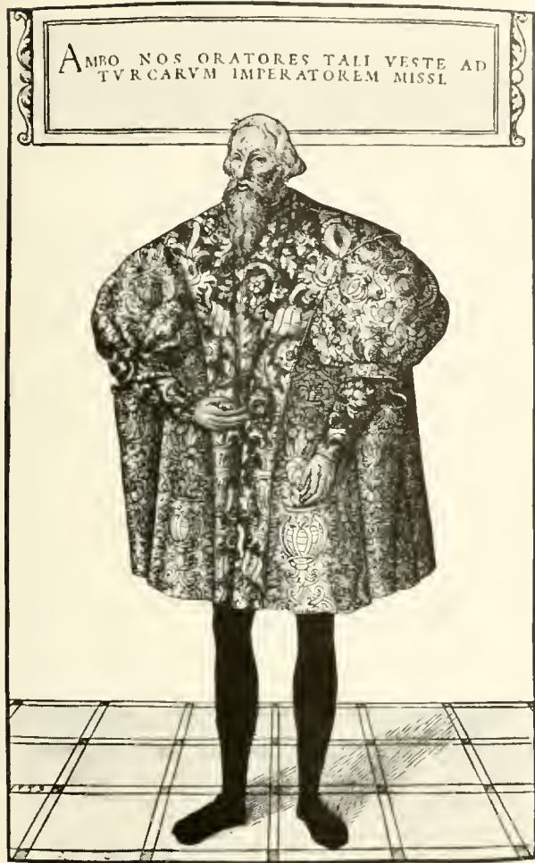
Figure 3.—DRESS OF SIGMUND VON HERBERSTEIN for an embassy to the Sultan, 1541. The short gown ( Schaube ) of Italian brocade figured with black and gold has wide shoulders and padded upper sleeves. The collar, lining, and foresleeves are of similar fabric but with a dark violet ground for contrast. From Gratae Posteritati , 1560.

of their times, their portraits of individuals consisted in the main of medallie heads and busts. It was the German portrait painters who, to a greater extent, recorded and disseminated the knowledge of fashions. Hans Burgkmair painted himself on the occasions of his betrothal in 1497 and his marriage in 1498, 5 and in the 16th century Hans Holbein the younger noted