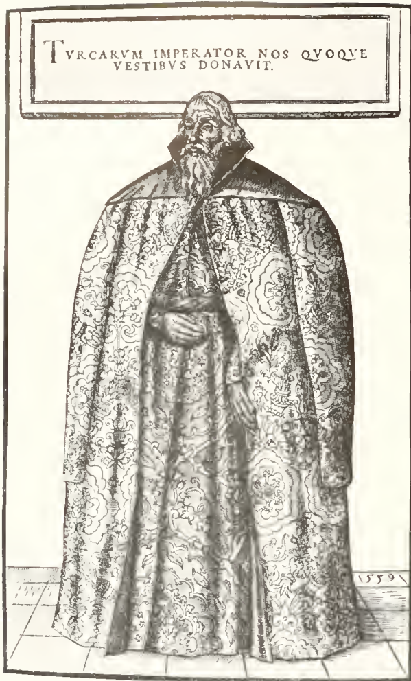
Figure 4.—SIGMUND VON HERBERSTEIN IN ROBES presented to ambassadors by the Sultan, 1541. The Turkish gown of yellow silk figured with black, with some of the medallions outlined in blue, has long sleeves that hide the hands. The inner robe is of red silk figured with yellow and gathered with a blue sash. From Gratae Posteritati , 1560.

in bowing low enough to kiss the hand of the seated Sultan. The imperial fashion of breeches and hose might have seemed indelicate to Suleiman "the Magnificent," who gave the ambassadors other robes (fig. 4): "The Emperor of the Turks presented us also with these robes." The long-gowned costume shown here should have been completed by a turban, but von Herberstein evidently would not allow himself to be depicted in this.