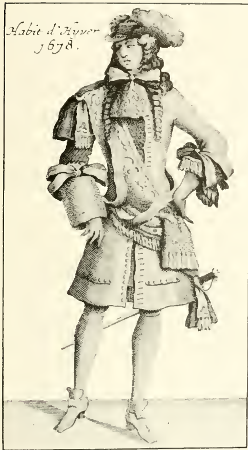
Figure 23.—GENTLEMAN in winter attire supposedly just returned from the army. He ordered his gray cloth suit from Sieur Gaultier, whose shop, "A la Couronne," was located in the Rue des Bourdonnais. From the Mercure Galant , October 1678.