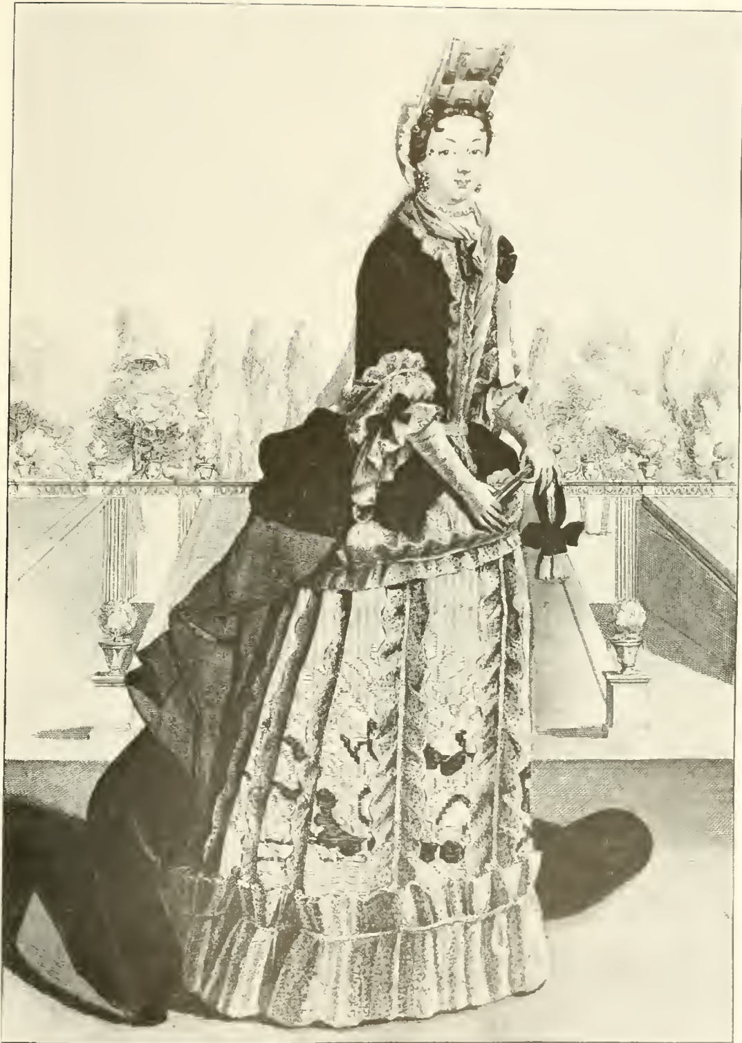
Figure 26.—DRESSED PRINT, ca. 1695. The engraving of Madame la Duchesse d'Aumont is embellished with small pieces of velvet, figured silk, and lace.