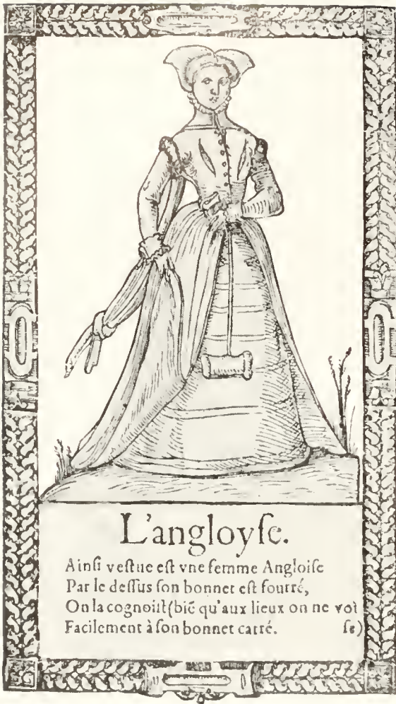
Figure 6.—PORTRAIT of an English lady. From Recueil de la diversité des habits, 1567 ed.

English lady (fig. 6). Although she is said to be distinguishable by her square bonnet, it is hard to find the style paralleled in any other picture. The huge slashes on the bodice of her gown surely are exaggerated, as is the smallness of the muff which hangs by a cord from her waist. On the other hand, Joris Hoefnagel copied and used the portrait as one of a group of citizens standing in the foreground of Hogenberg's 1574 plan of London, 17 so the figure must