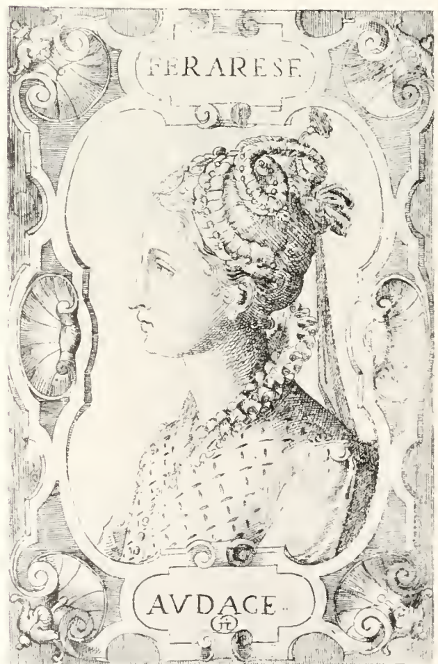
Figure 10.—FASHION PLATE depicting fanciful hair style of a lady from Ferrara, by Christoph Krieger. From Varie acconciature di teste , ca. 1590.

At this time there were also woodcuts illustrating hairstyles. The exact date of Christoph Krieger's Varie Acconciature di Teste (fig. 10) is not known. While Vecellio had remarked that the Venetian ladies were imitating the goddess Diana and surmounting their tresses with two little curls like horns, Krieger made illustrations that were even more fanciful. Each lady bears the name of a city and a distinguishing quality or temperament, but there is no more reason to connect the styles with local fashions than to believe