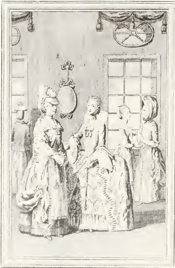
Figure 30.—PLATE SHOWING fashionable dress at Weymouth. From The Lady's Magazine , 1774.

had as an objective the formation of a sort of picture gallery of costume portraits of English ladies. Heideloff called it a Repository, which is what we would call an archive today, but the term came to be used by Rudolph Ackermann for his general magazine, The Repository of the Arts . . . , published between 1809 and 1828 (see p. 89). The ladies in Heideloff's aquatints are all different in the sense that they are dressed differently and doing different things, but the variations are mostly fanciful (fig. 31). In fact, the Heideloff prints served to fill picture books or to be pinned up or framed on walls; they do not differ greatly in their approach from the series of the Bonnarts and their contemporaries during the reign of Louis XIV.