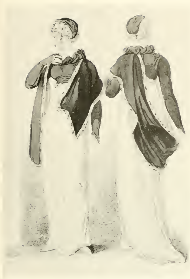
Figure 32.—FRONT AND BACK VIEW of a walking dress showing that embroidered muslin was worn even in winter. Here, the muslin is accompanied by a red sarcenet Highland spencer and a matching scarf lined with ermine. From La Belle Assemblée , December 1808.