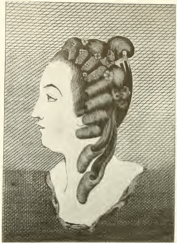
Figure 29.—ENGRAVING BY JEAN LE GROS depicting French hair style, ca. 1760. From L'Art de la Coiffure .

The 18th-century reading public became increas-