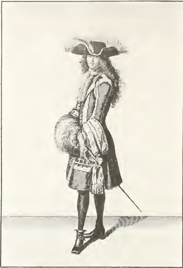
Figure 25.—MAN OF QUALITY at the court of Louis XIV. Engraving by Jean de St. Jean, 1693.

knife, and selected pieces of small-pattern fabrics were mounted on stiff paper forming an underlay to the print.