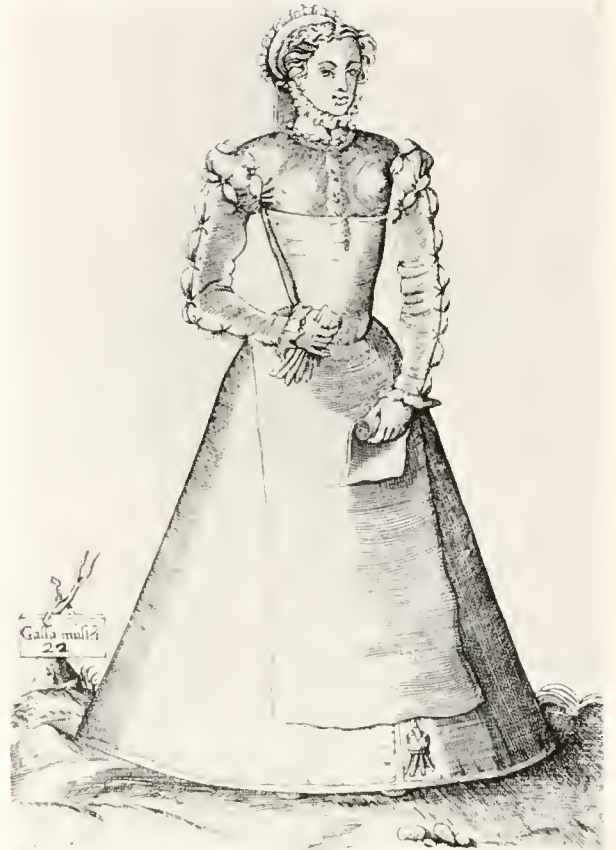
Figure 7.—DRESS OF A FRENCH WOMAN (front view) with a tight-sleeved bodice through the cuts of which the lining is drawn out in puffs. From Omnium gentium habitus . . . , 1563 ed.

have been regarded as approximately accurate.