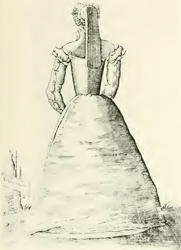
Figure 8.—DRESS OF A FRENCH WOMAN (back view) showing the manner in which the bodice was laced and the hood fell at the back. The skirt is raised, revealing the farthingale petticoat with the roll at its hem which contained cane stiffening ( verdugo ). From Omnium gentium habitus . . . , 1563 ed.