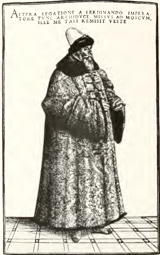
Figure 2.—DRESS OF SIGMUND VON HERBERSTEIN for the second embassy to Moscow, 1526. He wears a wide-sleeved gown with the collar and lining made of fine sables. His fur-lined high cap is of white felt, its brim distinguished by a band of red cloth, a mark of nobility. From Gratae Posteritati , 1560.

It has been assumed too readily perhaps that the fashion plate dates from the late 18th century, but it is not difficult to demonstrate that it existed in all its essentials at earlier periods, even though its history may not be continuous. The beginning of the illustration of fashions is found in portraits, the earliest of which, either sculptured or painted, developed from images of kings and important personages. 3 These images, unlike the imagines of the Romans, made no attempt to portray the features of an individual, but made his identity known rather by his clothes, his arms, and other indications of rank or position. The development of the stylized image into the personal portrait is well illustrated in the diary of Jörg von Ehingen. 4 Von Ehingen, who traveled widely in Europe during the years preceding 1460, might be described as a professional jouster, who took part,