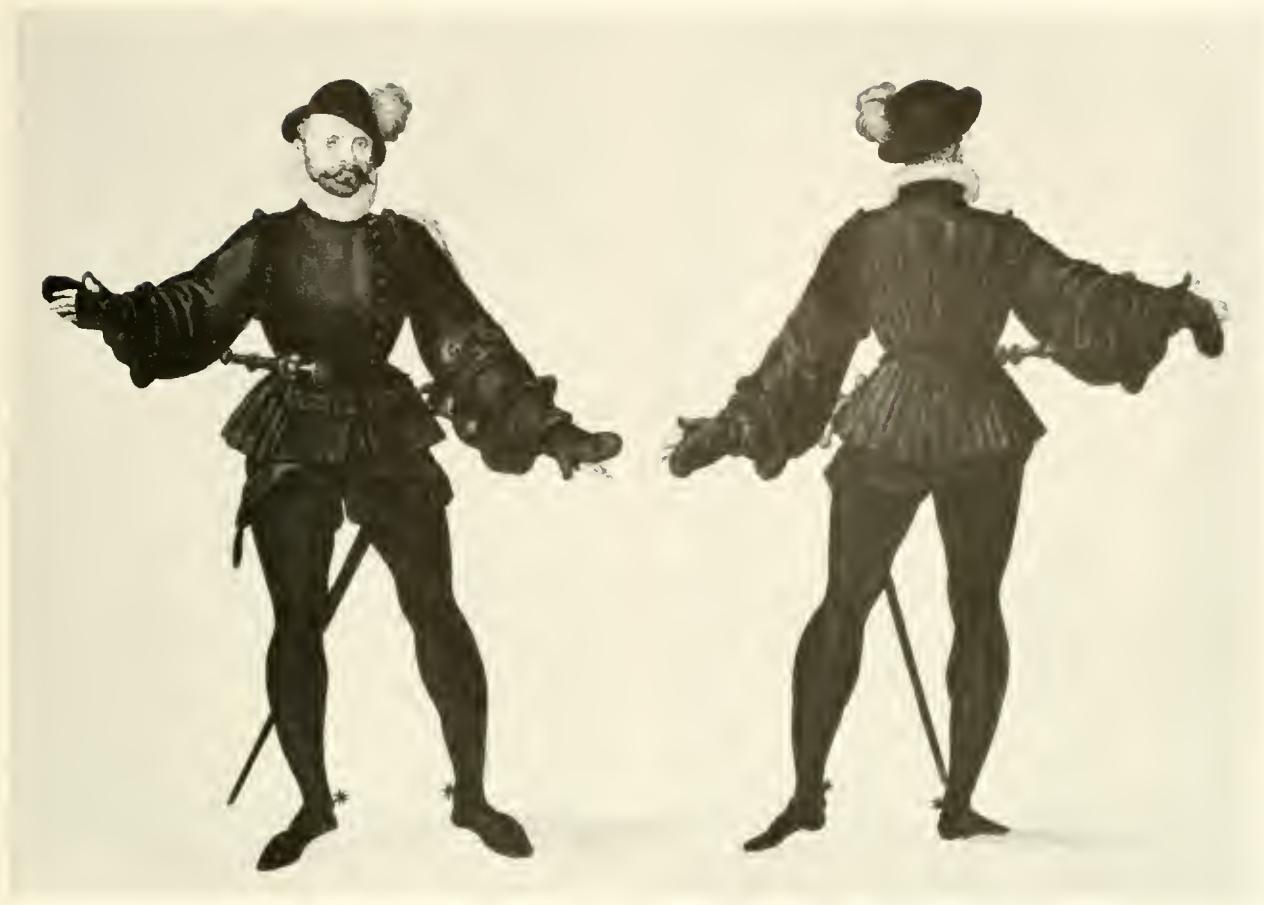
Figure 5.—LEAF FROM A BOOK of court costumes showing back and front view of a gentleman's dress. German, second half of the 16th century.

Spanish, Milanese, or French styles. As for men, it was said that they could not make up their minds what to wear, and a popular caricature shows an Englishman standing naked with a roll of cloth under his arm and a pair of tailor's shears in his hand, saying: 14