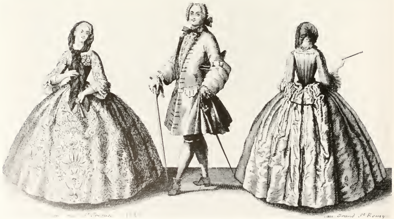
Figure 28.—FASHION PLATE, the first of the series Recueil des différentes Modes du Temps . The fabric of the dress on the right is a moiré or watered silk, on the left a “lace-pattern” brocade, often wrongly ascribed to the period of Louis XIII (1610–43). Issued by Herisset, ca. 1730. (Author’s collection.)