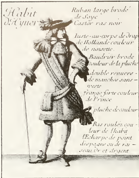
Figure 18.—OUTDOOR WINTER DRESS for men is strongly influenced by military fashions. An enormous fringed baldrick, tied by a military scarf, supports the diminutive dress sword. Wigs and hats were comparatively small for the winter 1677–78. Issued with the Mercuré Galant , 1678.