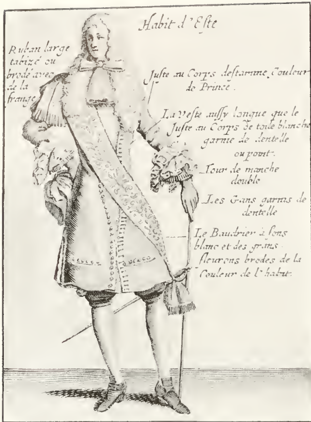
Figure 21.—SUMMER DRESS of a gentleman. He wears a linen waistcoat garnished with lace, and a long wig (cf. fig. 18). From the Extraordinaire of the Mercur Galant , June 1678.