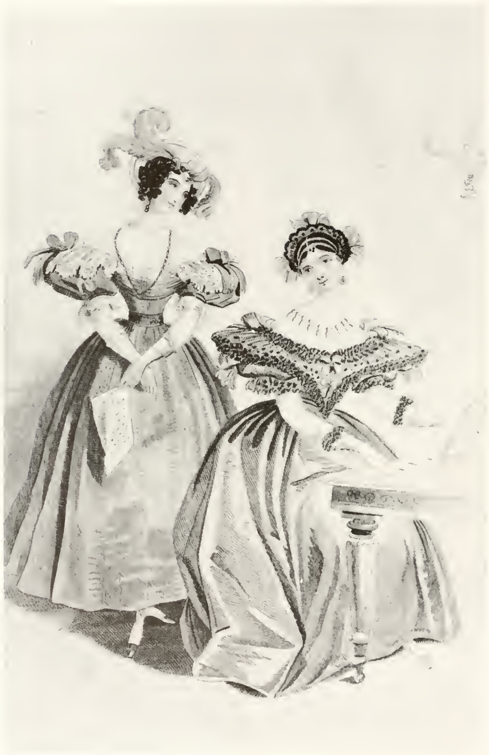
Figure 34.—PHILADELPHIA FASHIONS. At this date caps or hats were worn indoors with full evening dress. The details of this print were probably copied from a French or English fashion magazine. From Godey's Lady's Book , October 1833.