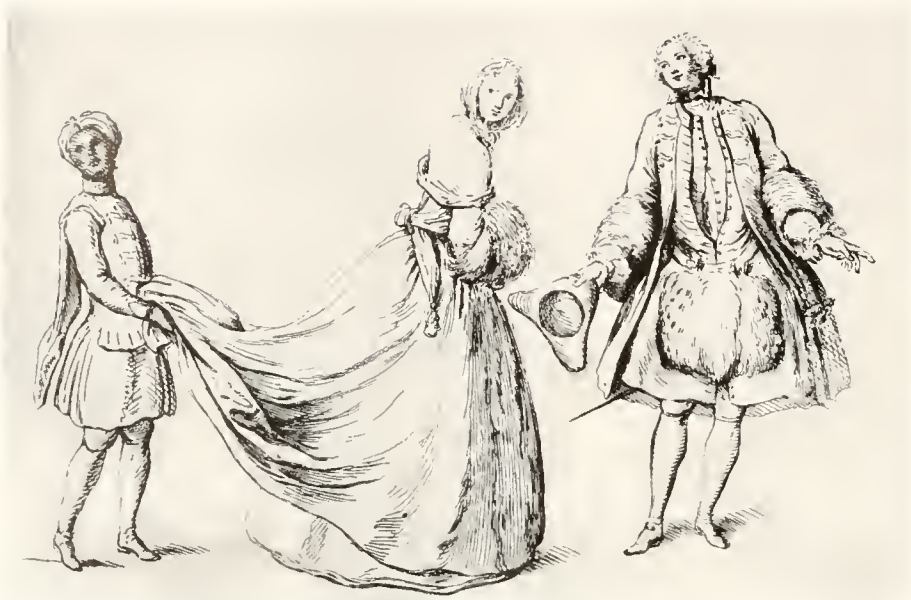
Figure 27.—FASHION PLATE depicting a lady with her page being saluted by a gentleman. From the Mercur de France , March 1729.