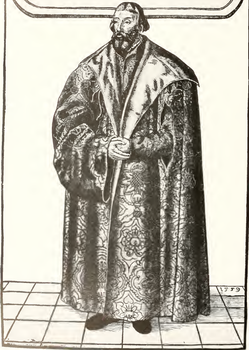
Figure 1.—DRESS OF SIGMUND VON HERBERSTEIN for the Polish Embassy in 1517. Over his doublet and breeches he wears a brocade gown lined with silk. From Gratae Posteritati , 1560.

MAXIMILIANO CAESARE AD SIGISMVN- DVM POLONIAE REGEM ET BASILIVM MA- GNVM MOSCOVIAE PRINCIPEM SIC VESTITVS DESTINATVS SVM.