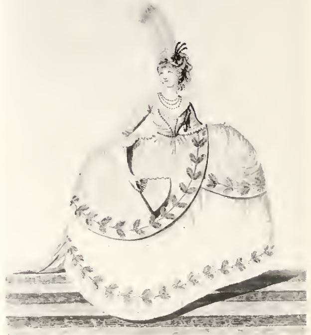
Figure 31.—PRINT OF A LADY IN A COURT DRESS ballooned out by side hoops, by N. Heideloff. The print does not attribute this fashion to any specific year. From the Gallery of Fashion , 1798.

It is not proposed to give an account here of the