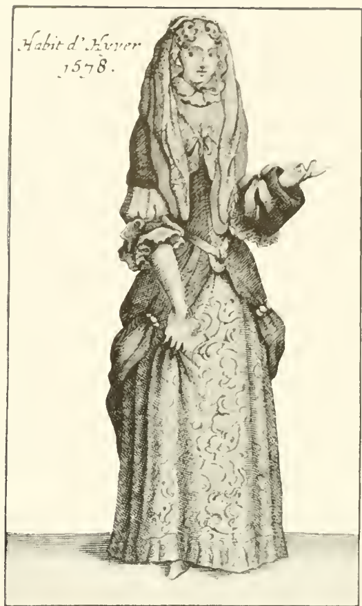
Figure 24.—LADY in winter dress of brown Florentine satin. Her petticoat is of off-white ( d'un blanc un peu sale) satin brocaded with blue, violet, red, and brown designs. From the Mercure Galant, October 1678.