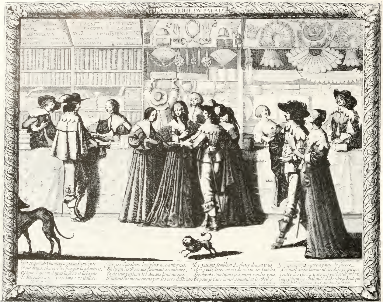
Figure 12.—LA GALERIE DU PALAIS. The fashionable crowd throngs the milliners' counters in the Palais Royal. By Abraham Bosse, 1636.

that the ladies of Ferrara were bold or those of Todi capricious