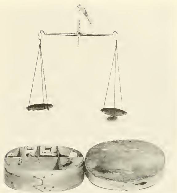
Figure 1. Medicine scales and oval box of medicinal herbs used by Dr. Solomon Drowne during the Revolution. Preserved at Fort Ticonderoga Museum, New York.

The British destroyed as much of the remainder as they could locate. 8