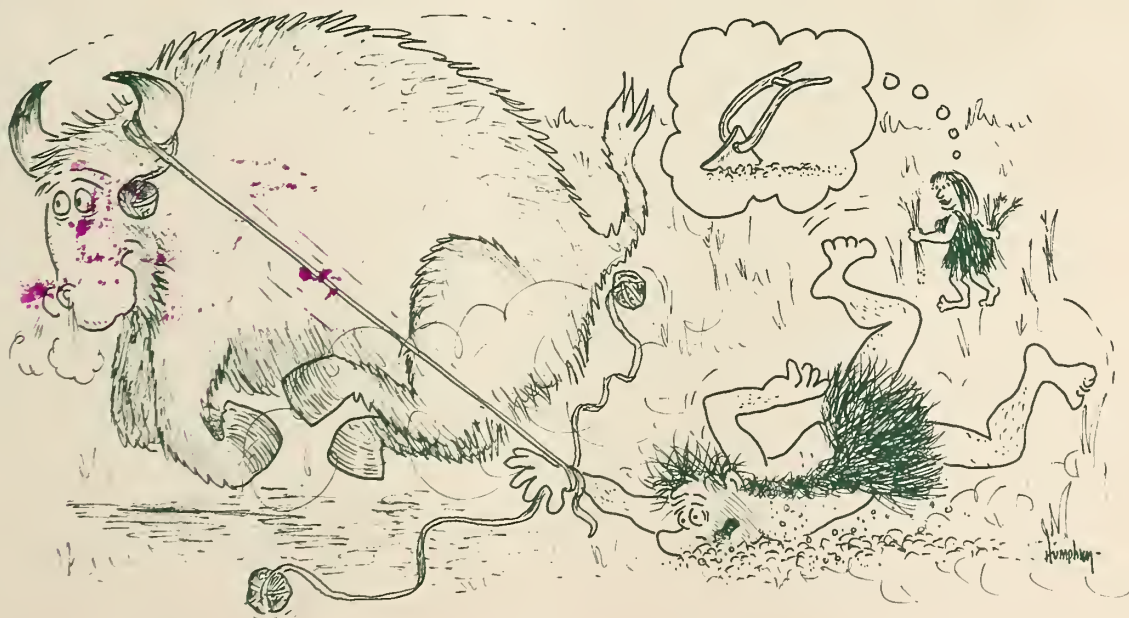
THE TRANSITION FROM HUNTING AND GATHERING TO DOMESTICATION

intervention in the life cycles of wild plants and animals. Plant domestication can be defined as the human creation of a new form of plant--one that is distinguishable