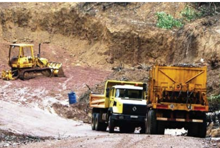
Changing drivers: Logging road construction in Gabon

by Chinese wood manufacturers is illegal or unsustainable (Ekström and Goetzl 2007; Rubin 2007) increases the chances of a general boycott of Chinese wood products (Laurance 2008). The Chinese government recently released a draft forestry handbook to provide guidelines for its companies operating overseas, but the country's timber exports remain at high risk in sensitive markets.