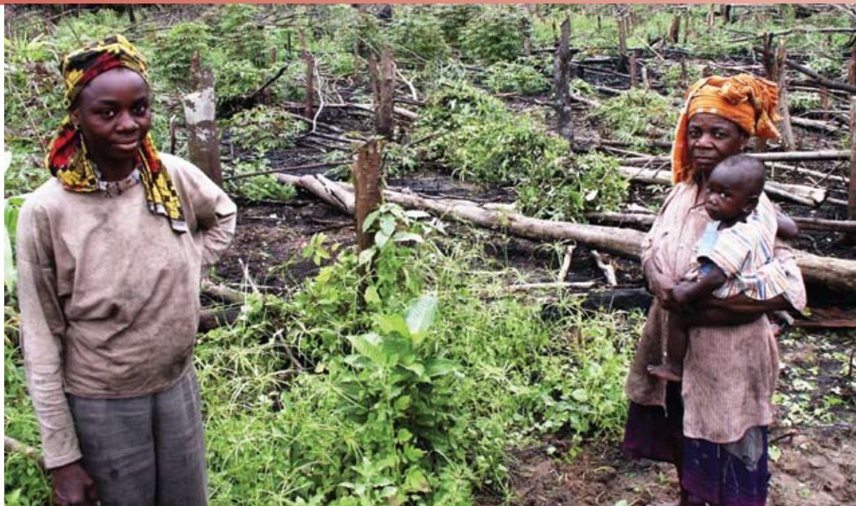
Food vs. forest: Small scale cultivators in Gabon

Smithsonian Tropical Research Institute Apartado 0843-03092, Balboa, Ancón, Panama laurancew@si.edu