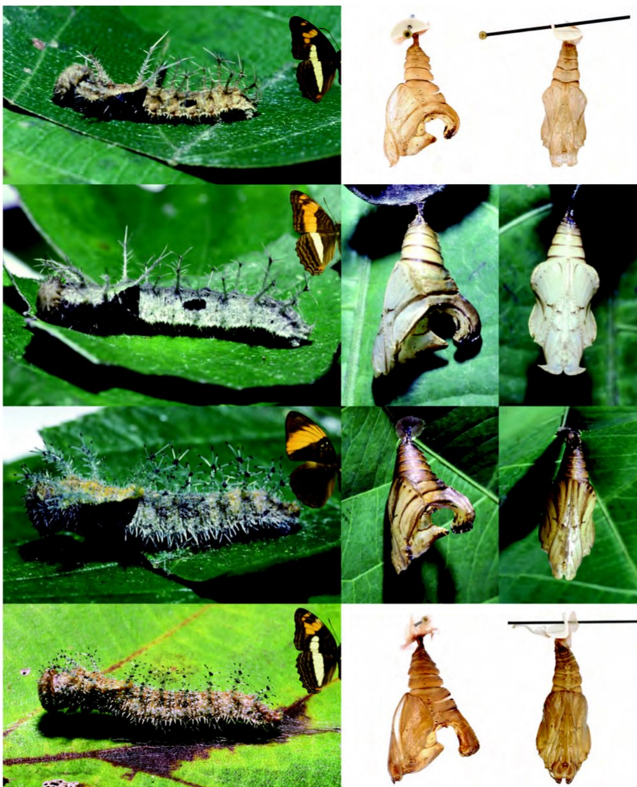
FIG. 4. Top row: Adelpha messana messana final instar, adult, pupal exuviae (lateral, ventral) (all lot 1989-22 #2); Second row: A. phylaca pseudoaethalia final instar, adult, pupa (lateral, ventral) (all lot 1983-78); Third row: A. lycorias melanthe final instar, adult, pupa (lateral, ventral) (all 1983-S #3); Bottom row: A. e. erotia "lerna" final instar and adult (lot 2000-20 #5), pupal exuviae (lateral, ventral) (lot 1996-24).