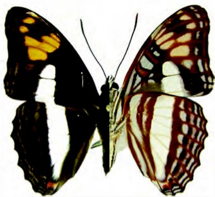
FIG. 1, Adelpha erotia erotia "lerna" adult, dorsal (left), ventral (right), lot 1996-24.

First instar setal terminology follows Stehr (1987).