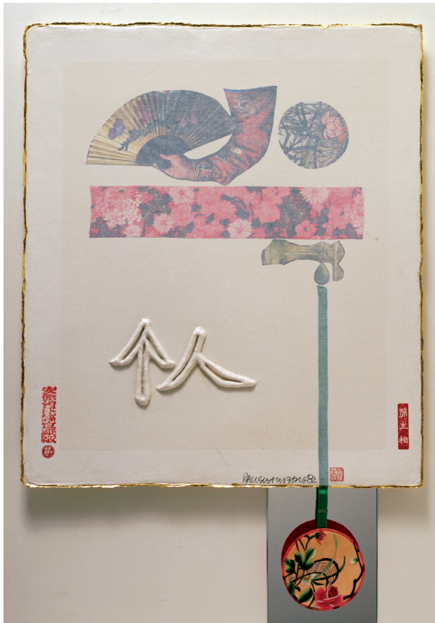
2. Robert Rauschenberg, 7 Characters: Individual , 1982. Silk, ribbon, paper, paper-pulp relief, ink, and gold leaf on handmade Xuan paper, 43 × 31 in. From a suite of 70 variations published by Gemini G.E.L., Los Angeles © Estate of Robert Rauschenberg/Licensed by VAGA, New York.

his designs and ideas so that they could work on them in the mill, show him what they did, and continue with the procedure until he completed a series of paper-based works entitled 7 Characters (Figure 2).