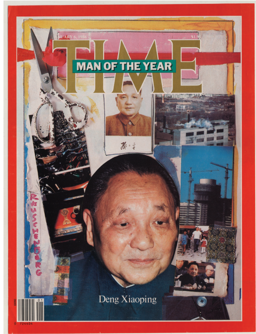
7. Robert Rauschenberg, Portrait of Deng Xiaoping for Time 's "Man of the Year," cover, 6 January 1986