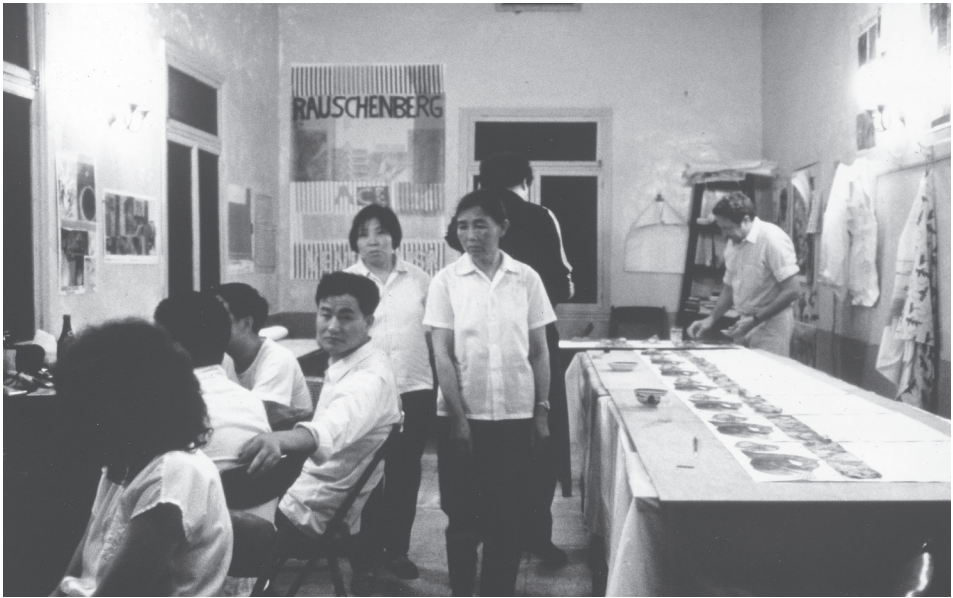
1. Robert Rauschenberg working on 7 Characters series, Xuan Paper Mill, Jingxian, China, June 1982.

Thailand, Japan, and, behind the Iron Curtain, Czechoslovakia and Poland. During the tour, he produced not only sets and costumes for the dance company but also created his own works from local materials—including “Combines” that resemble found materials. In Tokyo, for instance, he made a major Combine entitled Gold Standard , collecting junk objects from the streets and assembling them on a traditional gold folding screen. This engagement with a local culture set a pattern for Rauschenberg’s future international enterprises. In addition, as he had the responsibility of “taking the most impoverished, impossible spaces and turning them into real theatrical events” as a stage manager, he considered the 1964 world trip a “good out-of-town rehearsal for ROCI.” 7