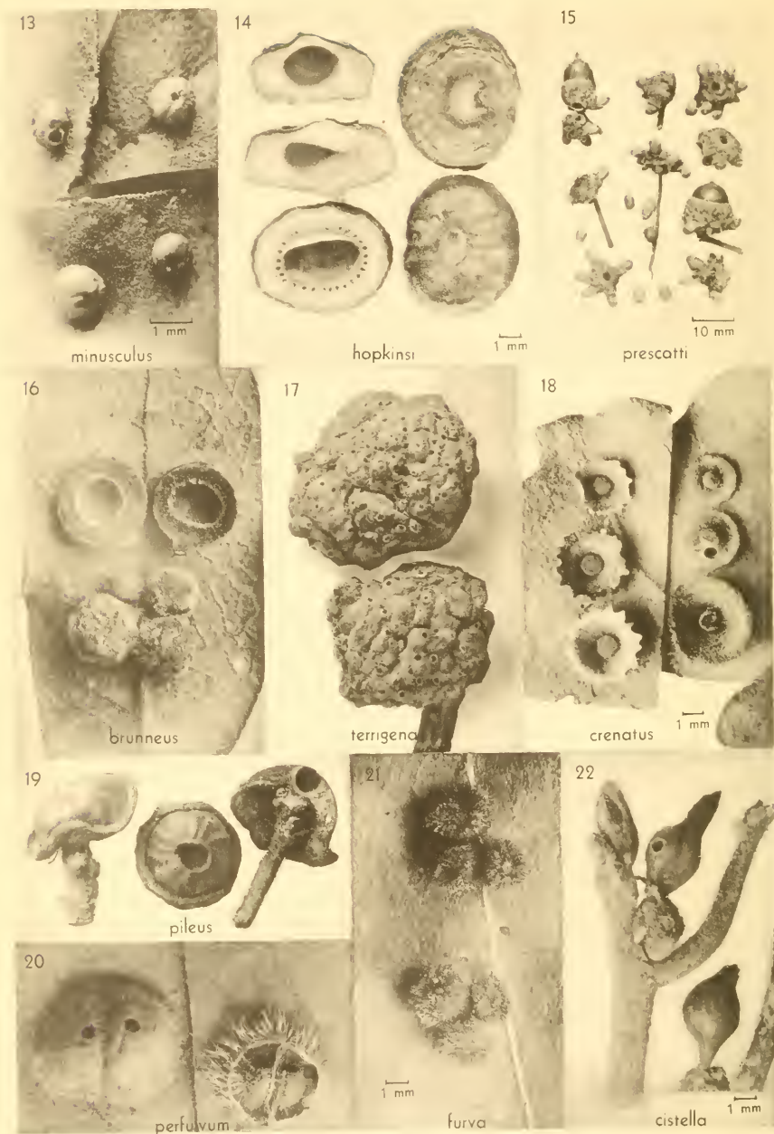
13, Dryocosmus minusculus on Quercus agrifolia ; 14, Callirhytis hopkinsi on Q. imbricaria ; 15, Andricus prescottii on Q. suburbinella ; 16, Andricus brunneus on Q. dumosa ; 17, Diplolepis terrigena on Rosa sp.; 18, Andricus crenatus on Q. dumosa and Q. douglasii ; 19, Antron pileus on Q. suburbinella ; 20, Trichoterus perfulum on Q. chrysolepis ; 21, Callirhytis furva on Q. palustris ; 22, Callirhytis cistella on Q. emoryi .