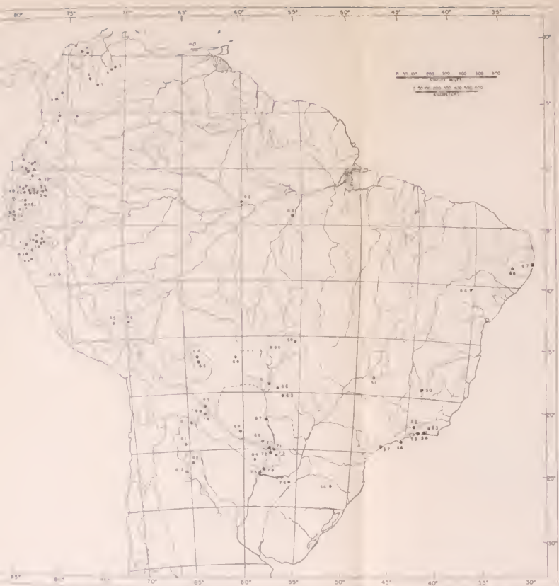
FIGURE 4. Collection localities of South American tapitis, Sybilagus trassiensis . See following pages for keys to subspecies and localities. 553011-40 (Face p. 372)