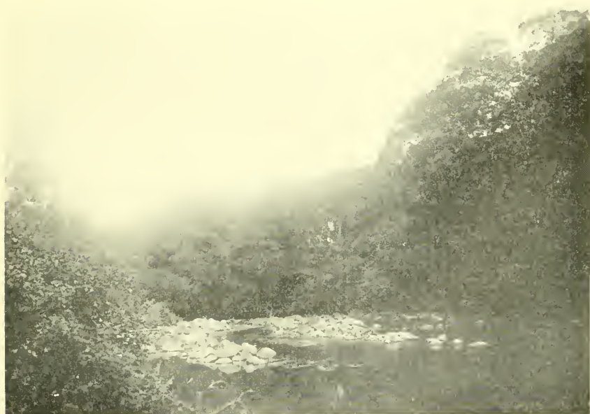
2. Río Colorado, northwest of Liberia, Costa Rica. October 20, 1940.