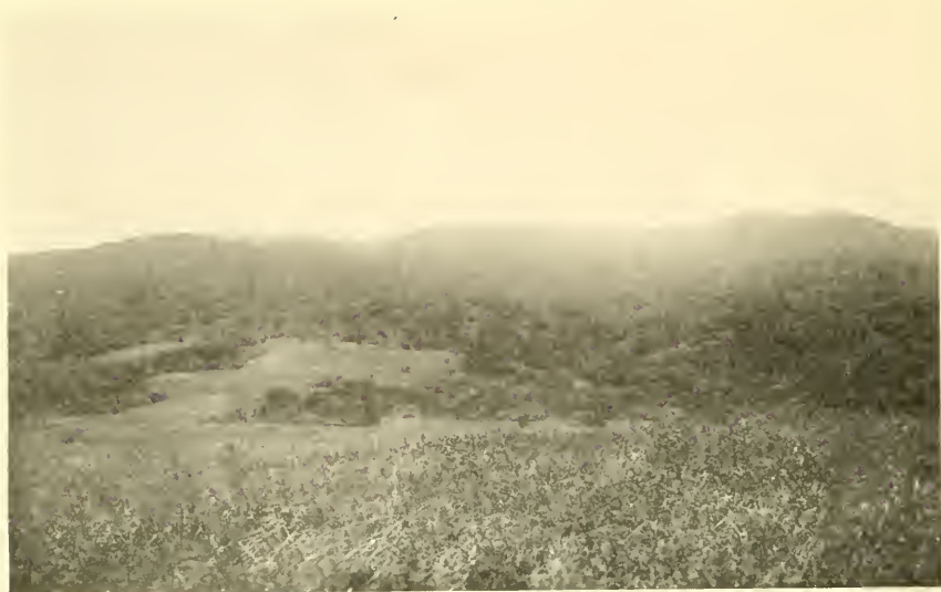
1. Looking across pasturelands to the forested slopes of Cerro Santa María. November 6 1940.