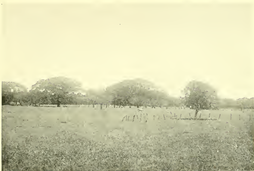
1. Guanacaste trees in pasturelands near Liberia, Costa Rica. October 19, 1940.