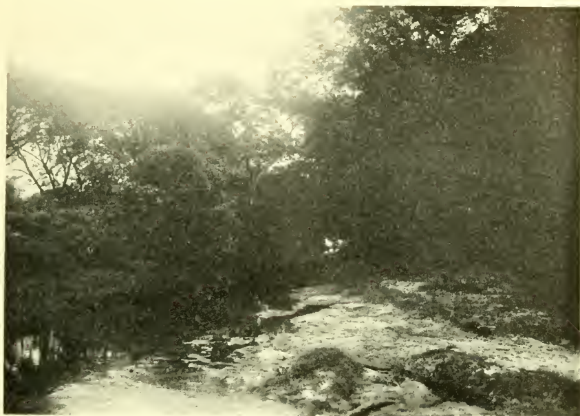
1. The Río Liberia below Liberia, Costa Rica. October 22, 1940.