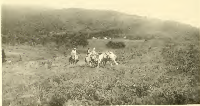
2. The Hacienda Santa María, with the wooded slopes above obscured by mist. November 16, 1940.