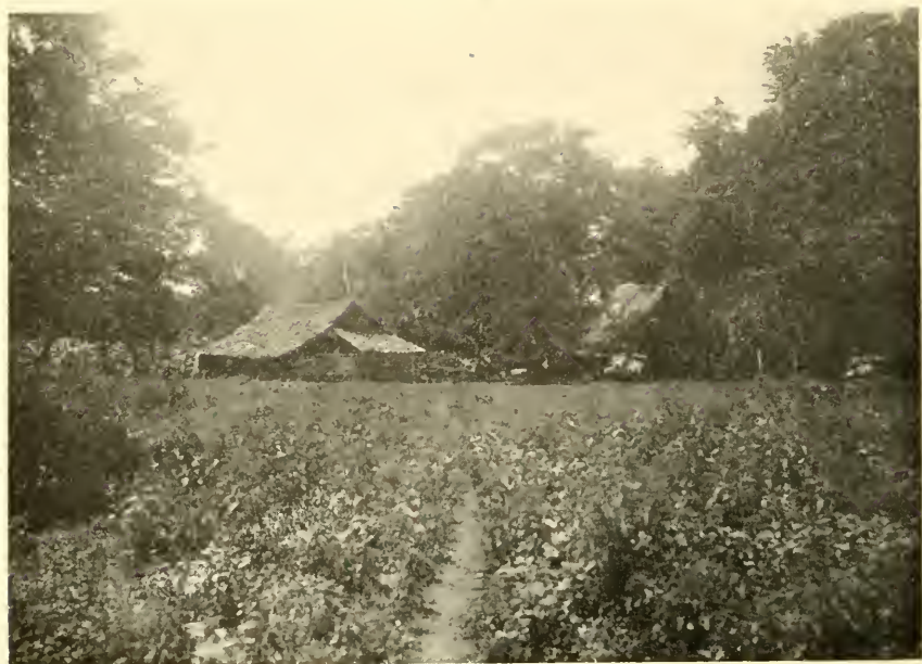
1. Near the Río Colorado, northwest of Liberia, Costa Rica. October 20, 1940.