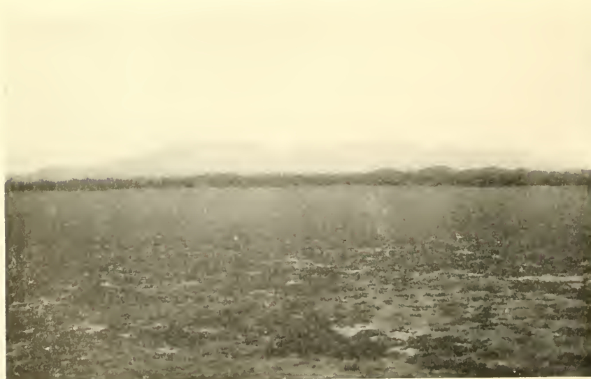
2. The Volcán Rincón de la Vieja from the airport at Liberia, Costa Rica, the barren volcano being the highest point, with the wooded Cerro Santa María adjacent at the right October 21, 1940.