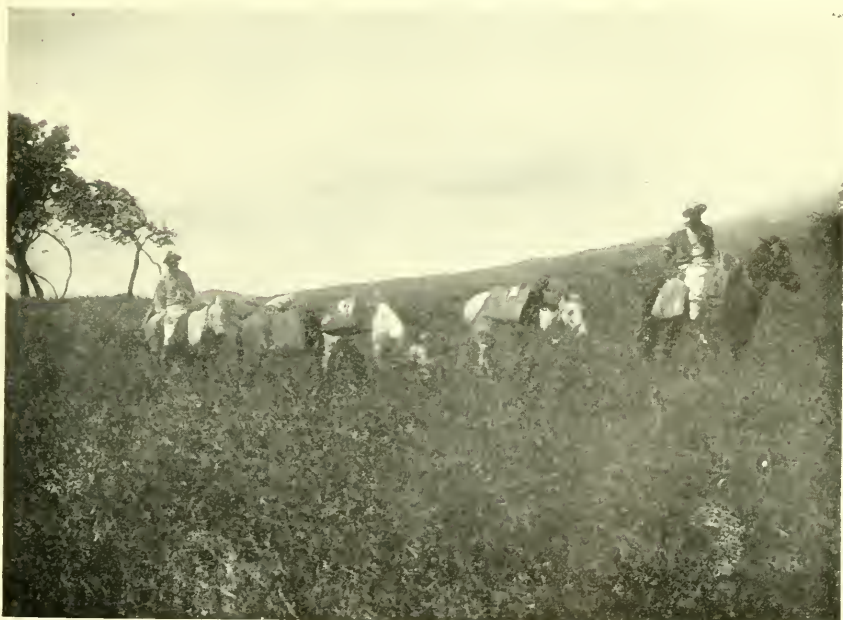
2. Open grassland on the southern base of the slopes of Volcán Rincón de la Vieja. November 4, 1940.