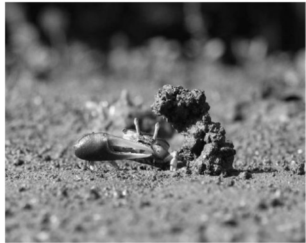
Figure 1. Male Uca beebei with a mud pillar at his burrow.