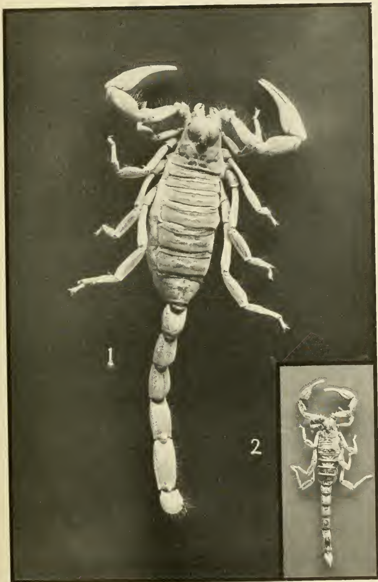
SCORPIONS OF WESTERN UNITED STATES