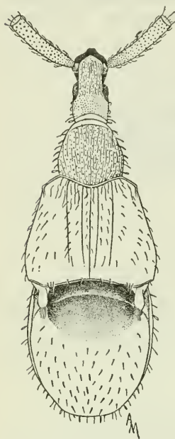
FIG. 6.—PUSTIGER CLAVIPHILIS, NEW SPECIES. DRAWN BY A. MOTTER.

than behind, sides moderately convex; surface moderately convex in front, flat behind; sculpture coarse, similar to head. Mesosternum coarsely and irregularly longitudinally striate. Elytra more than twice as broad as prothorax, broadest behind middle; posterior corners narrowly rounded, border concave; finely punctate, basally with numerous short striae and two long ones extending subparallel to the sutural striae; humeri with oblique margins, which extend backward as very short striae. Abdomen regularly and distinctly, though finely punctate, a little longer than elytra, strongly convex posterior to the pit, which is broad and deep and grooved at bottom; lateral tubercular structures small, elongate, fascicles thin. Propygidium four times as broad as long. Legs short and rather stout.