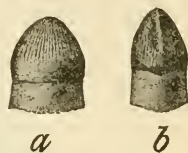
FIG 1.—TWELFTH MAXILLARY TOOTH OF BRACHYCHAMPSA MONTANA. NATURAL SIZE. a, LATERAL VIEW; b, POSTERIOR VIEW. TYPE-SPECIMEN.

In the collection of the U. S. National Museum there is a large number of detached teeth from the "Ceratops beds" of Converse County, Wyoming, which can not be distinguished from those in the specimen under discussion. With them are other teeth which from their minute size and other differences appear to indicate the presence in those beds of one or more undescribed species, but the material is too meager upon which to base a determination. Many of these scattered teeth showed wear on their internal surfaces, thus substantiating the evidence of the Alligatoroid nature of the bite as shown by the worn posterior teeth of the type-specimen.