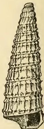
FIG. 2.—EUMETA BIMARGINATA C. B. ADAMS.

Shell elongate-conic, wax-yellow, except the posterior row of tubercles, which are light brown. Nuclear whorls four and one-half; the first half turn smooth; the remainder well rounded, separated by a constricted suture, marked by curved, quite regular, slender, distantly spaced, axial riblets, of which 16 occur upon the second, 18 upon the third, and 20 upon the last turn. Post-nuclear whorls concave in the middle, marked by two spiral cords, the first of which is at some little distance anterior to the summit, leaving a narrow, plain band at the summit, while the other is equally remote from the suture, the space between the two being about double the width of the spiral cord and the plain space at the summit. In addition to the spiral cords, the whorls are marked by well-rounded axial ribs which are very feeble posterior to the spiral cord at the summit. Of these ribs, 18 occur upon the first to third, 20 upon the fourth and fifth, 22 upon the sixth and seventh, and 24 upon the penultimate turn. These ribs are expanded where they meet the spiral cords, forming well developed tubercles at their junction. The spaces inclosed between the spiral