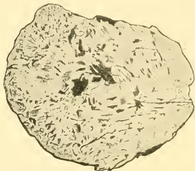
FIG. 1.—ENSTATITE CHONDRULE OUT OF HENDERSONVILLE METEORITE.

The most interesting feature is the presence of occasional small areas like that shown near the center in fig. 1, Plate IX. This, under a low power, has all the appearance of a fragment of clastic rock composed of rounded and irregular particles, all of the same mineralogical nature (in this case olivine), embedded in a cement seemingly irresolvable but showing polarizing points. Under as high a power as the thickness of the section warrants using, this interstitial material is