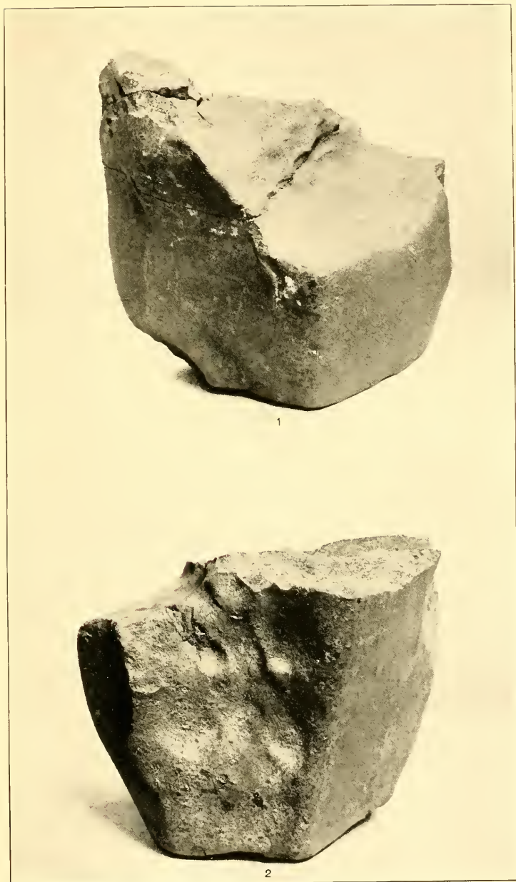
THE HENDERSONVILLE, NORTH CAROLINA, METEORITE.