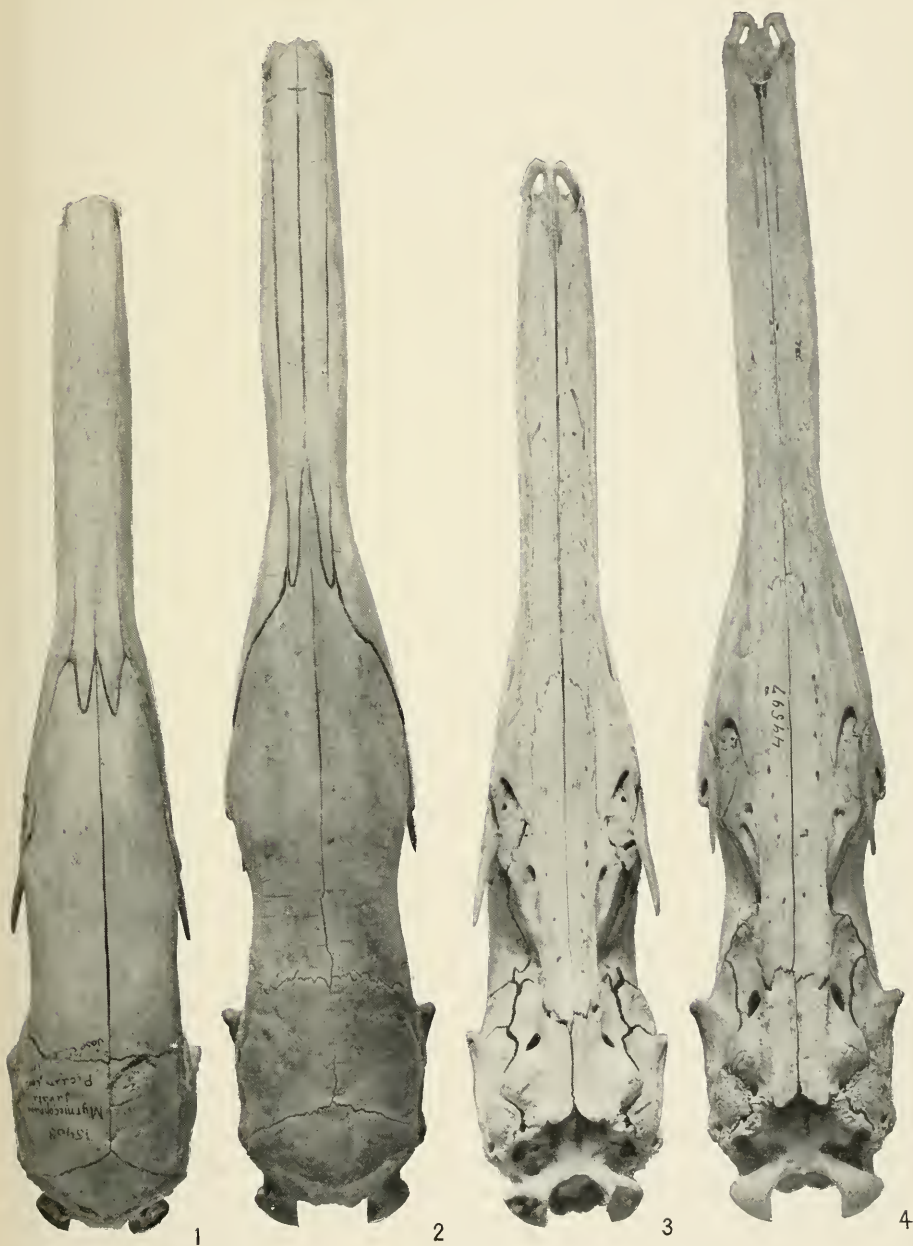
SKULLS OF GREAT ANT-EATERS.