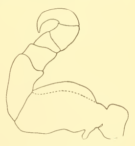
Fig. 2.—Livoneca convexa. Seventh leg. \times 11½.

The first and fourth thoracic segments are each about 1½ mm. long. The second and third segments are shorter than the first and fourth and are subequal,