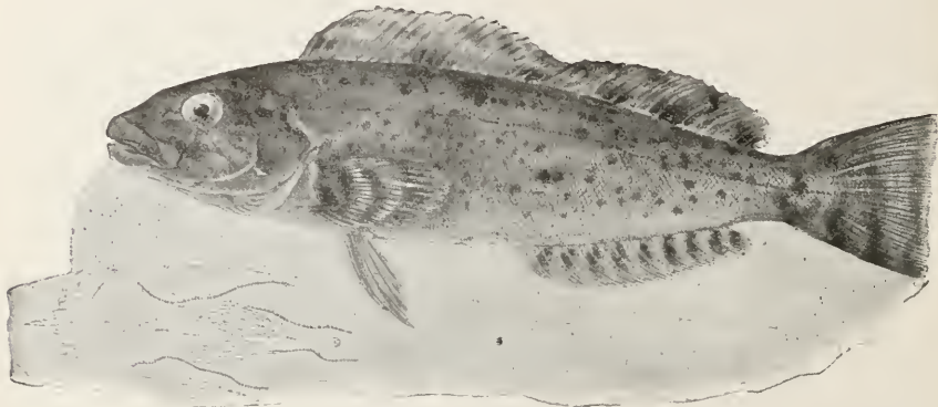
FIG. 1.— HEXAGRAMMOS ABURACO .

Maxillary reaching to front of pupil. Outer teeth enlarged in both jaws; vomer with teeth; palatines toothless. A short flap above eye, fringed at the edge; its length is scarcely equal to diameter of pupil; a pair of very small tentacles at nape.