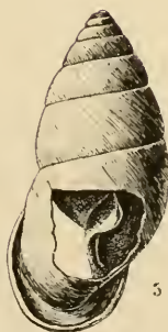
LOWER CALIFORNIAN BULIMULUS.