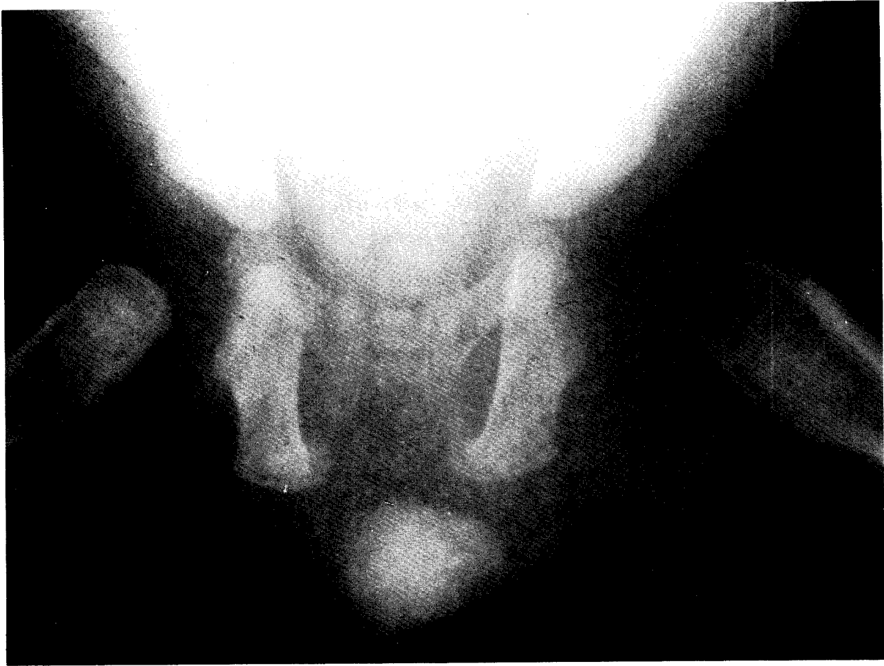
Fig 2—Ventrodorsal radiograph of the pelvis, demonstrating radiolucency of the left femoral head and widening of the left coxofemoral joint space. (The right coxofemoral joint is radiographically normal.)

ical signs (inappetence, limited movement, fever, pain) should not rule out the diagnosis of suppurative arthritis. Clinical signs and laboratory data in this orangutan were initially unimpressive.