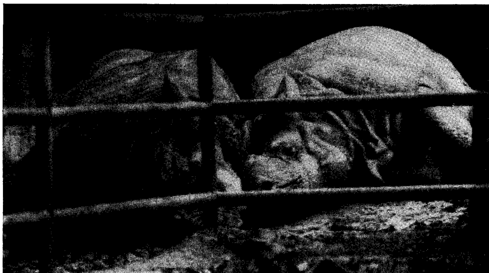
Fig. 3. ♀ (on the right) often lay down beside the ♂ in wallows, apparently to promote contact and arouse the ♂ sexually

and 13 minutes, respectively, and for <1 minute on 2 occasions thereafter. During the evening of 29. 7., the ♀ was observed licking the ♂'s genitalia over a 7-minute period, sometimes shifting to the ♂'s side and licking there. On 3 other occasions (<1 min) the proestrus genital licking was extremely brief and seemed inconsequential. The ♂ pulled back and/or lifted his hind leg when the ♀ licked his leg or genitalia. Both the ♂ and ♀ would exhibit a reflexive lifting of the hind leg when the lower leg, inguinal region, or genitalia were stroked or rubbed by a human. The ♂ also would develop a partial erection at such times.