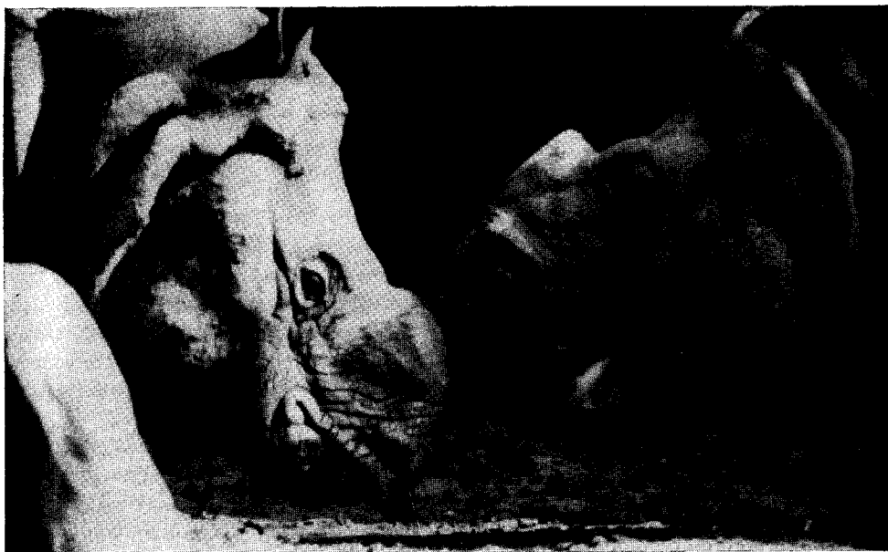
Fig. 5. Open-mouth biting by the ♀, which often inflicted minor wounds on the ♂'s forehead when jabbed by the ♀'s lower incisor tusks. Such biting was almost always accompanied by loud honking vocalizations by the ♀, while the ♂ remained silent