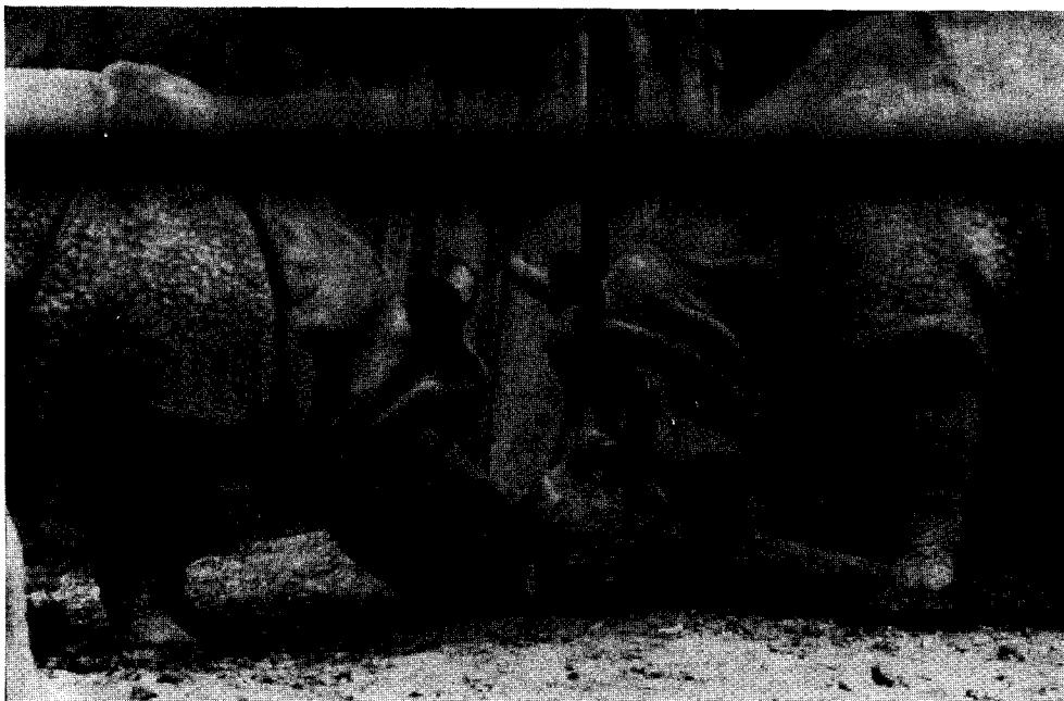
Fig. 4. Mutual horn rubbing, which is usually associated with vigorous head-to-head encounters involving clashing of horns, pushing with horns, open-mouth biting by the ♀, ♀ vocalizations, and other aspects of ritualized "fighting"