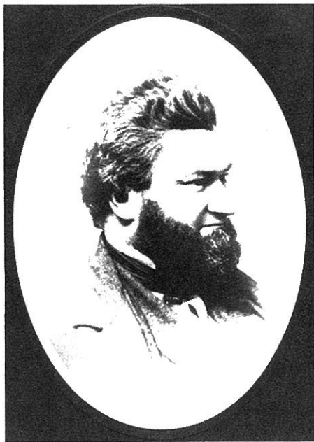
Spencer Fullerton Baird, secretary of the Smithsonian Institution, 1878–87.

When Joseph Henry died in 1878, Baird was appointed secretary of the Smithsonian and director of the newly established United States National Museum. The devil found no work for Spencer Baird's hands.