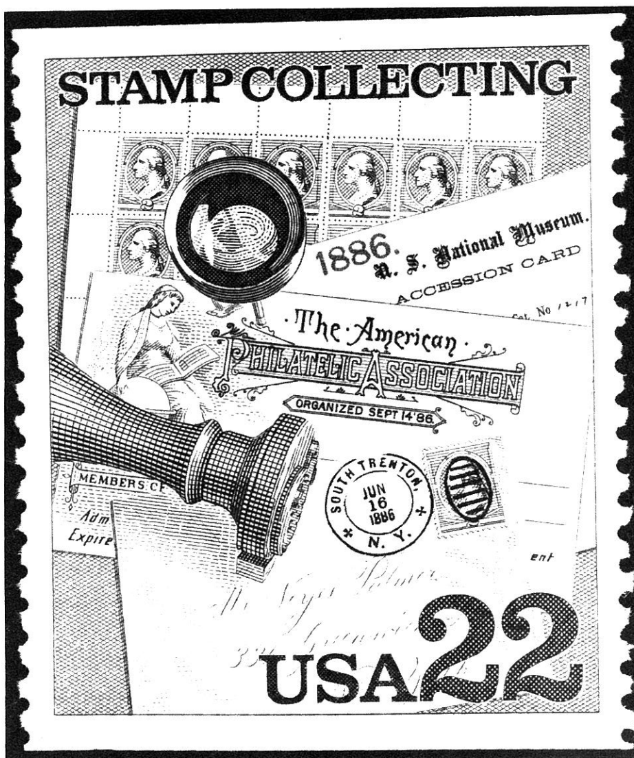
Scott No. 2198. The magnifying glass in the upper left corner belonged to S.F. Baird, and is part of the Baird memorabilia in the Smithsonian's Museum of American History.