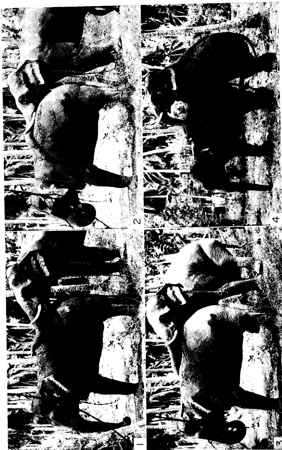
Figs. 1 to 4. Mating behaviour of the Asiatic elephant. Fig. 1 illustrates 'reach over'. The first expressions of male behaviour towards a sexually receptive female. Fig. 2. Male next responds with an erection. Fig. 3. Female in oestrus showing an 'immobility response' to chin-resting pressure by the male. Fig. 4. Female in 'standing' oestrus.