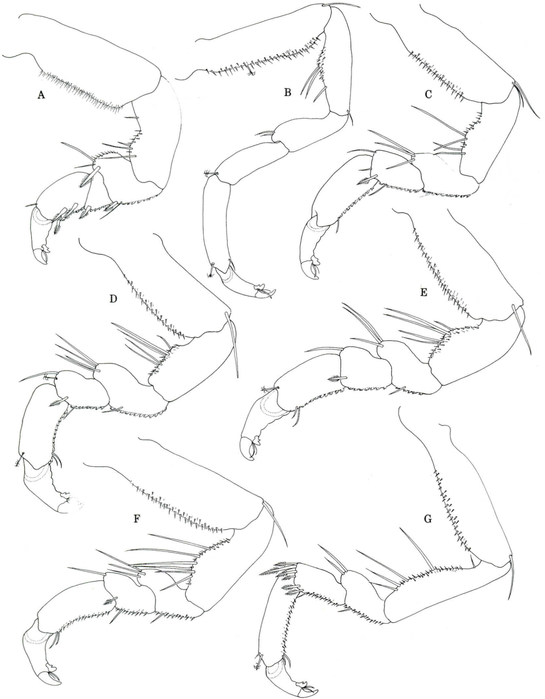
Fig. 2. Cymodocella algoense : A-G, Pereopods 1-7 respectively.